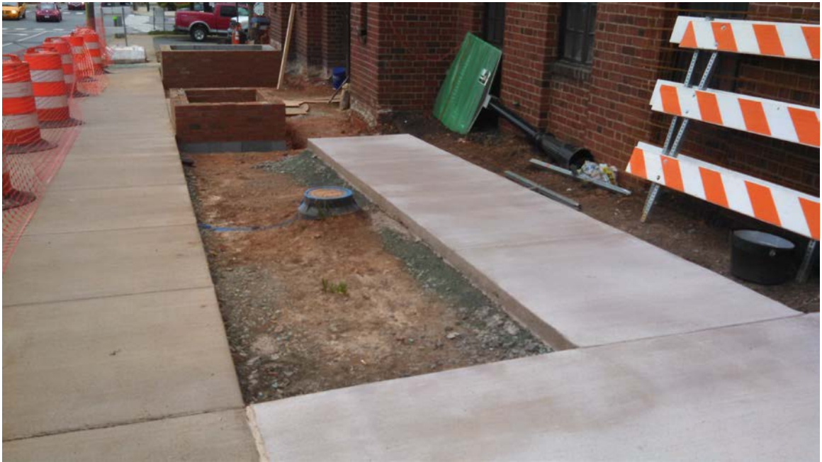
North Side/Market Street Entrance ADA improvements