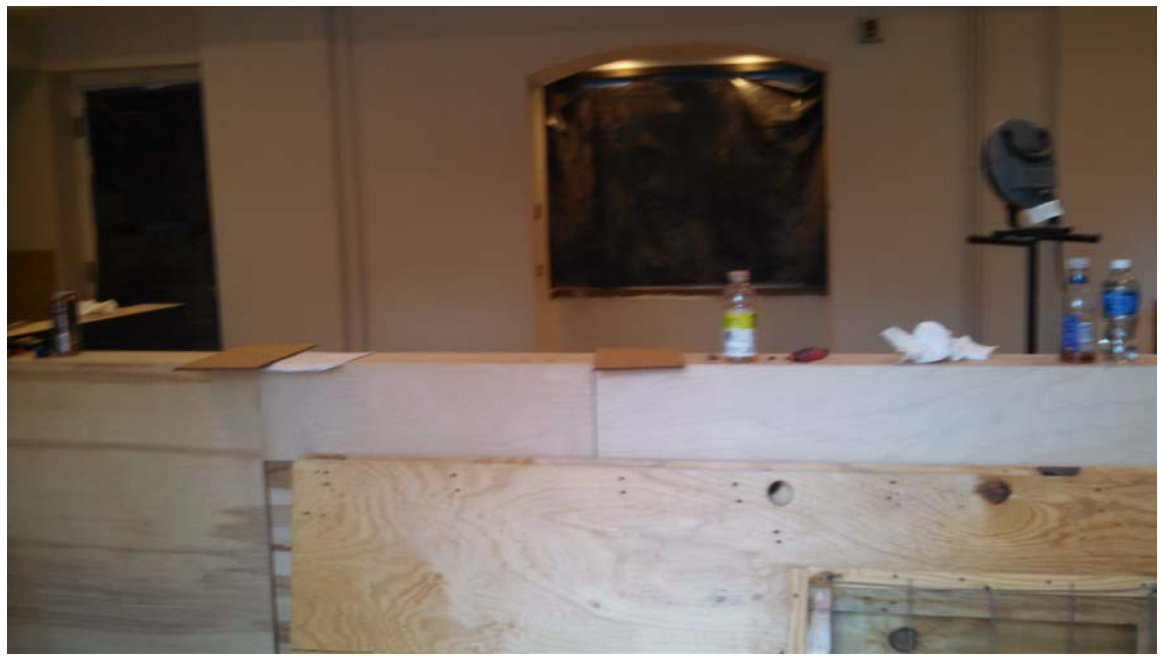
Entrance Interior – New Front Desk