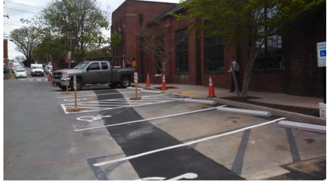
Exterior – West side sidewalk and drainage

A project to improve the exterior access, enhance ADA Accessibility and the interior spaces of the Herman Key Recreation Center has been under construction since February of 2017. Staff will provide an update on the construction. Some pictures of the work are provided below.