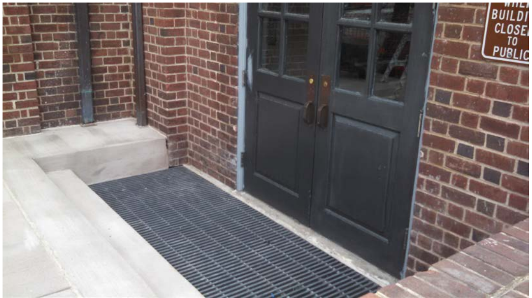
North West Exterior – Drainage and Doors