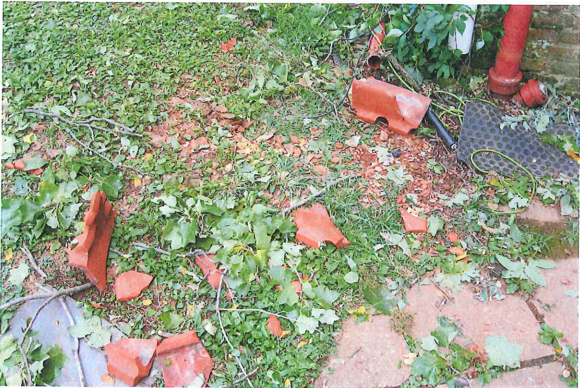
terracotta roof ridge tiles