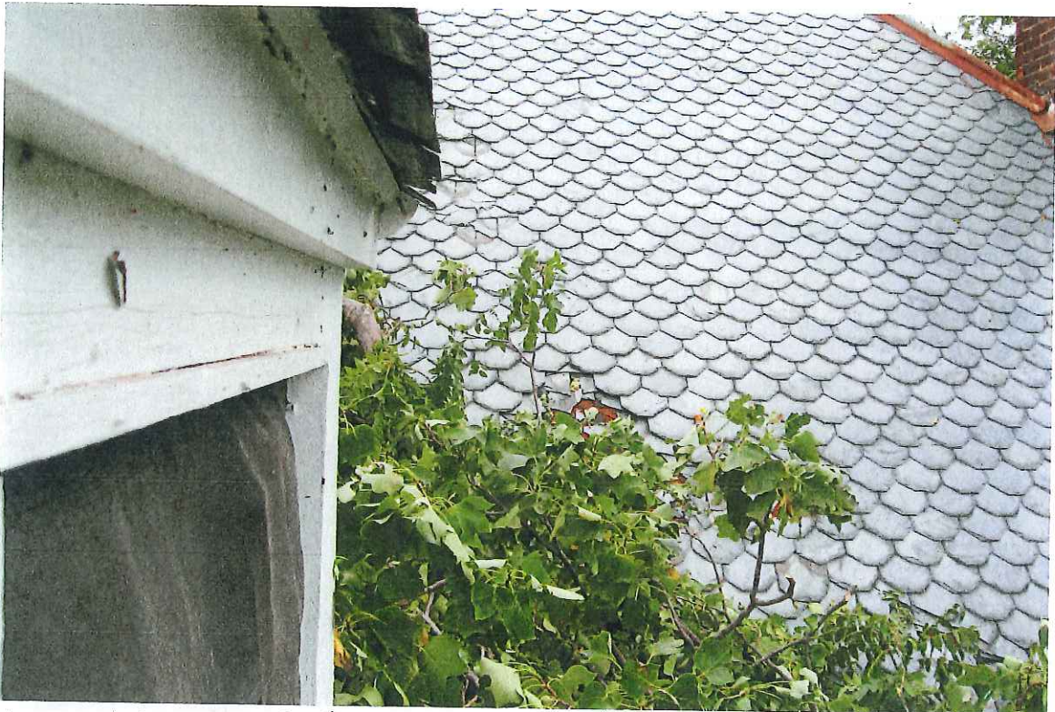
large hole in roof (obscured by limb)