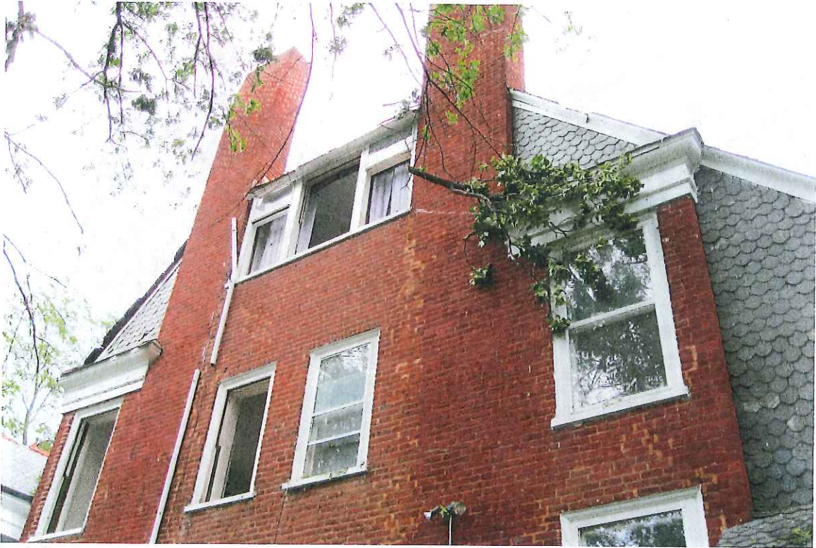
Window and downspout damage; tree limb penetrating roof