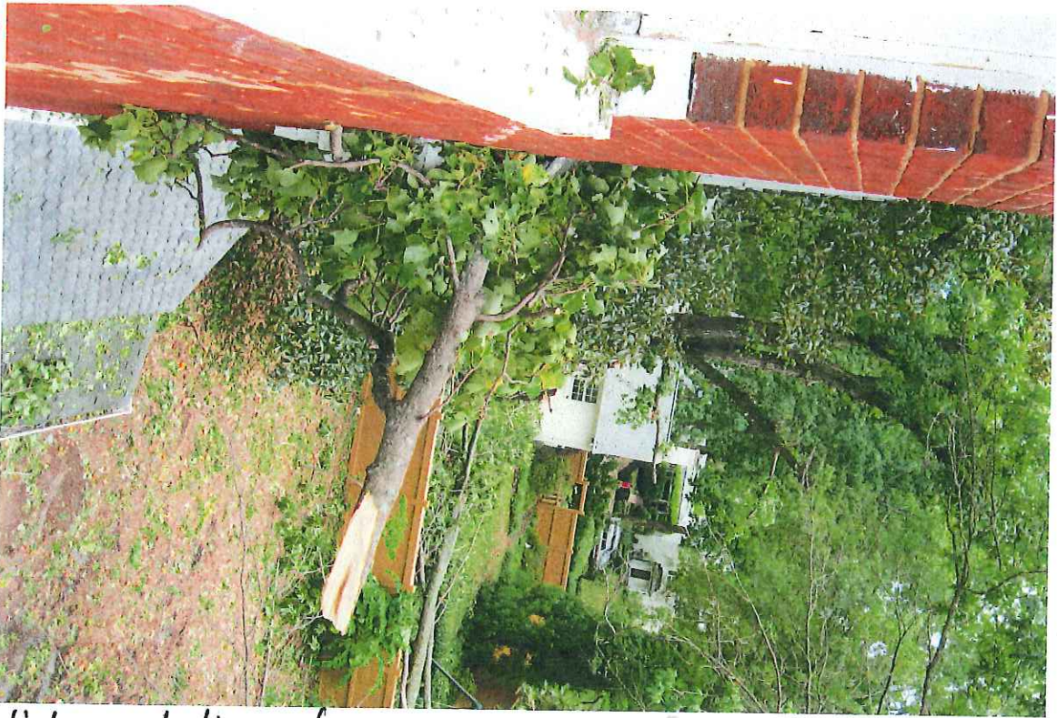
limb penetrating roof