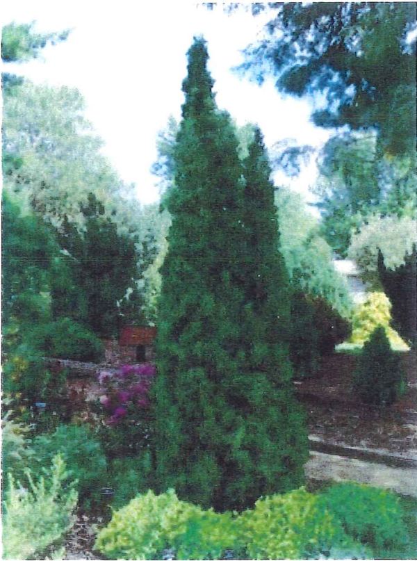
Thuja occidentalis 'Degroot's Spire'