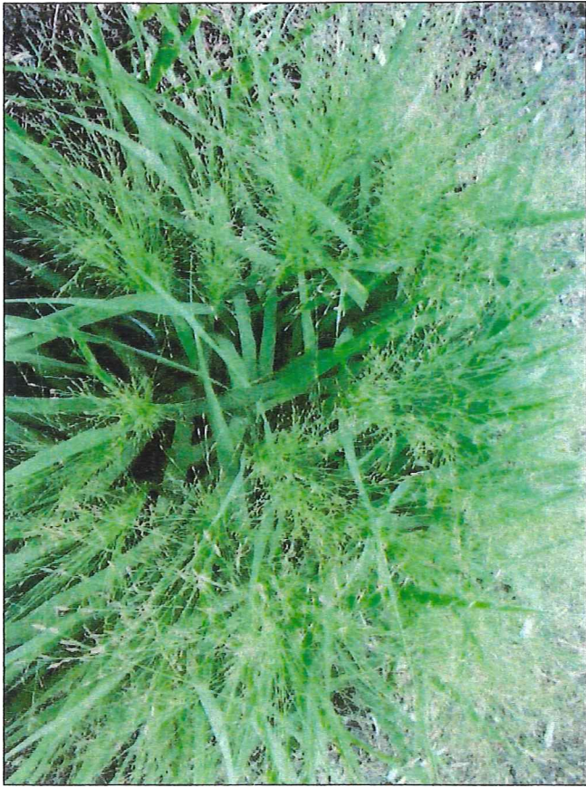
Purple Lovegrass Eragrostis spectabilis