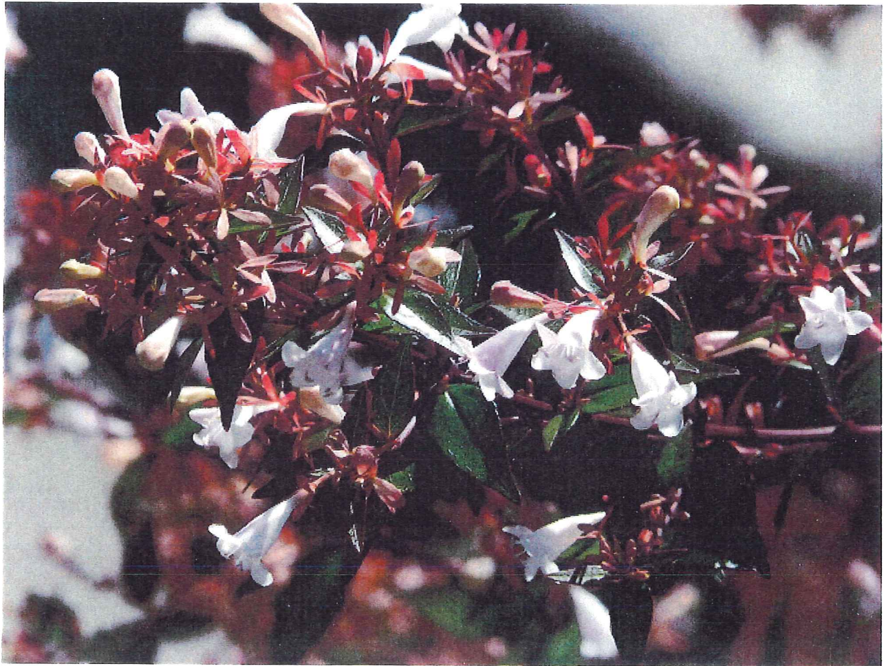
Abelia x grandiflora 'Sherwoodii'