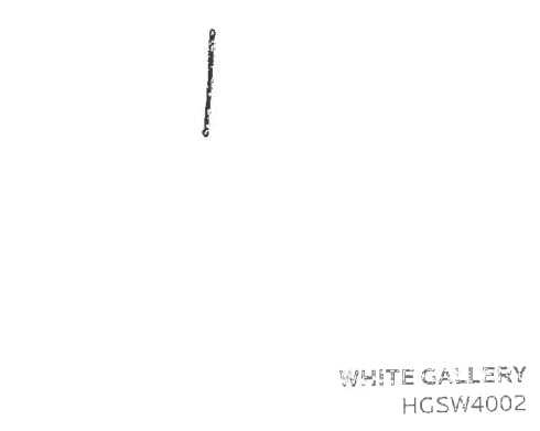
Current Trim Color - Will not be changed