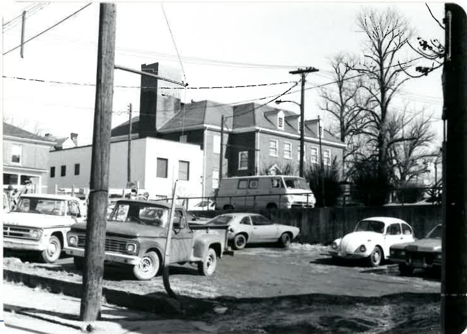
, associated with the property.)