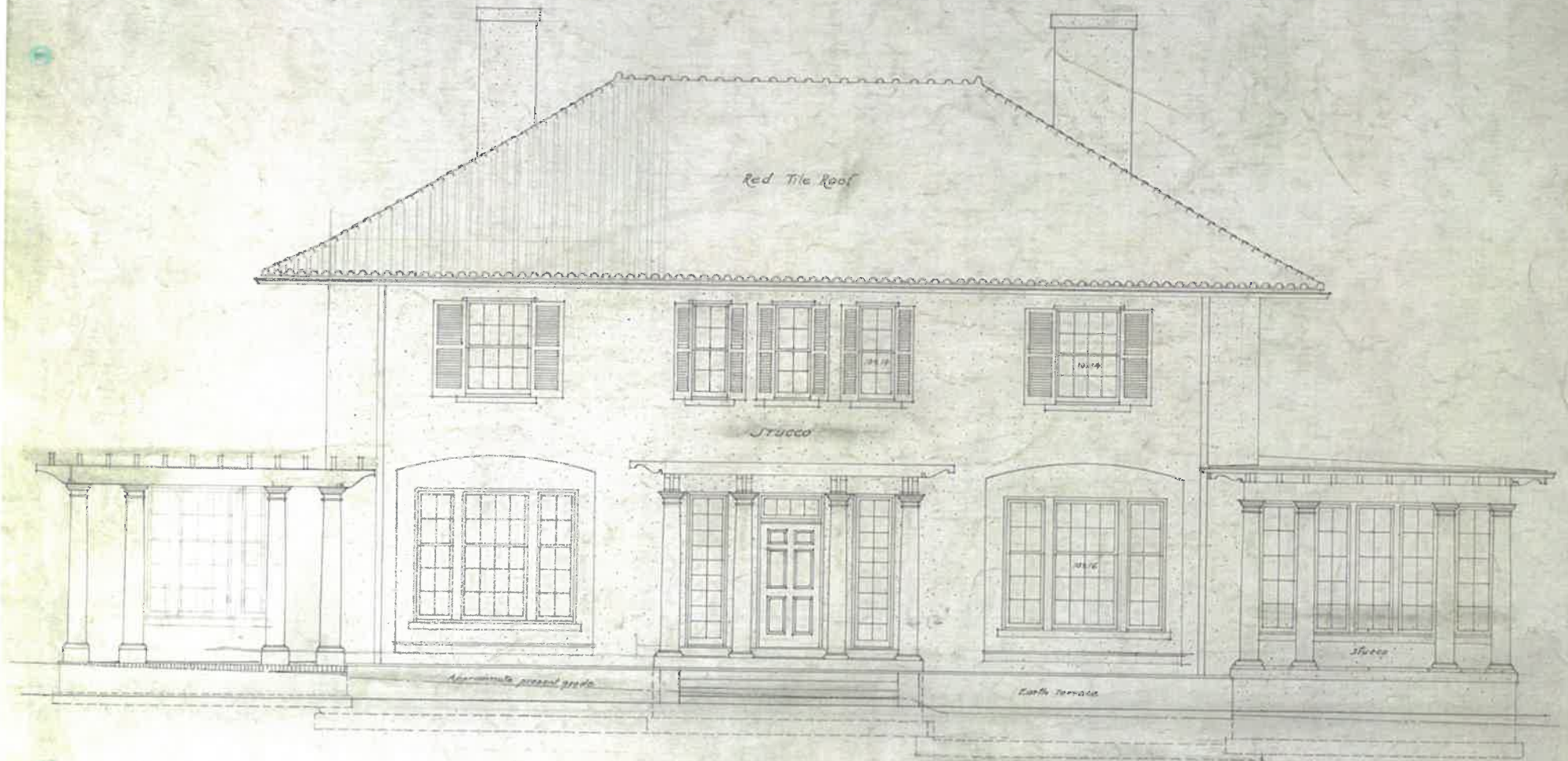
FRONT ELEVATION Scale 1/4" inch = 1 foot