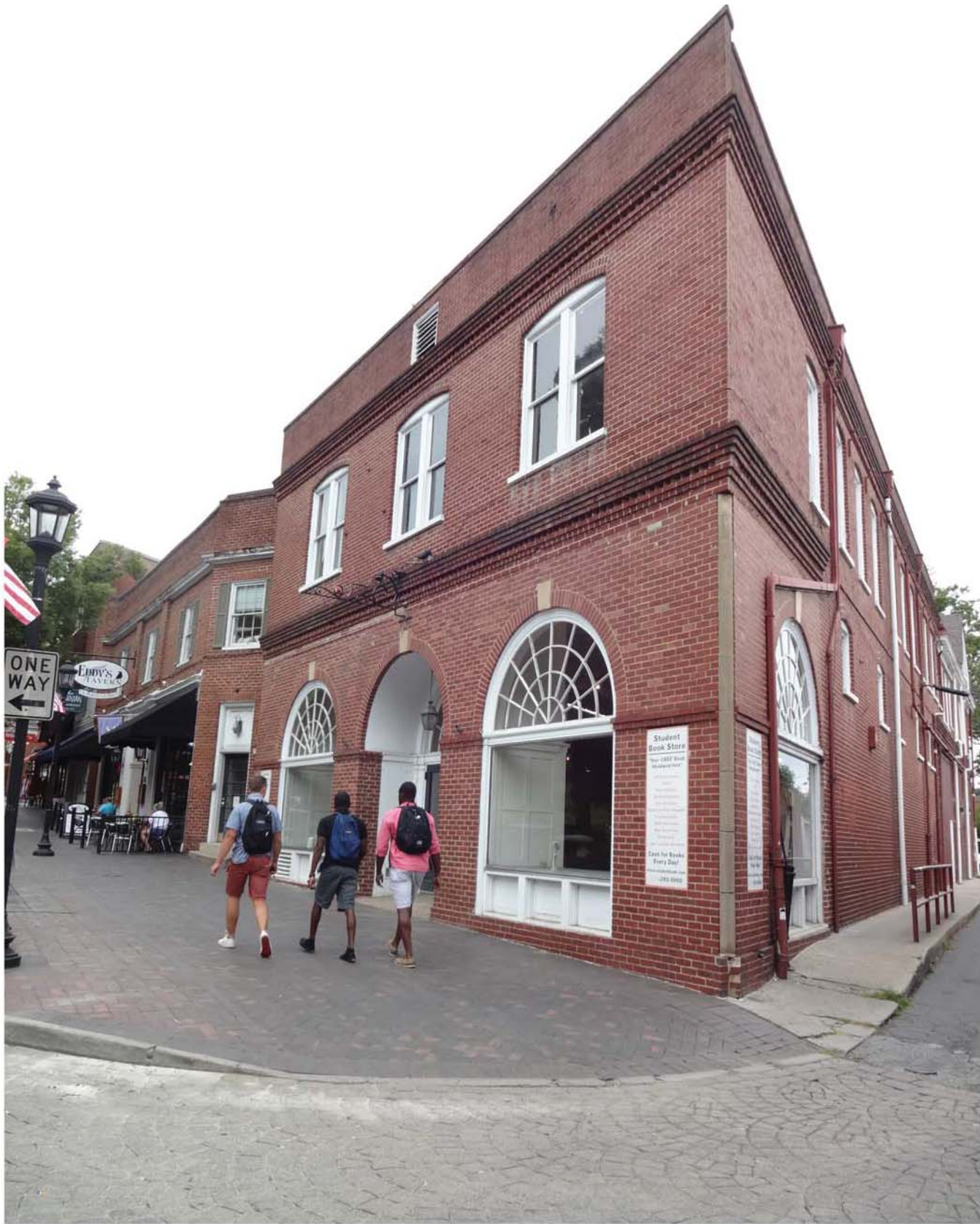
FRONT VIEW FACING WEST