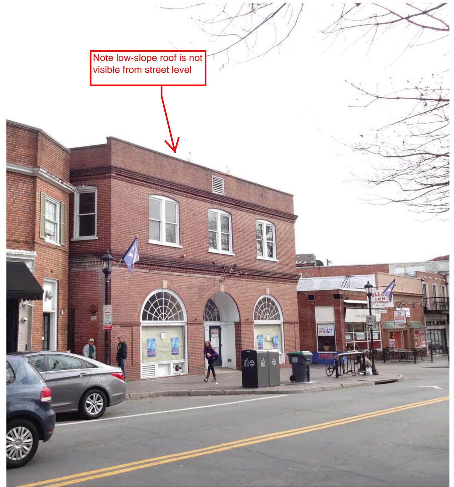
FRONT VIEW FACING EAST

1515 UNIVERSITY AVE. CHARLOTTESVILLE, VA