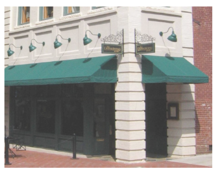
Gooseneck lights provide moderate levels of illumination and focus the light downward onto the awnings and the storefront.