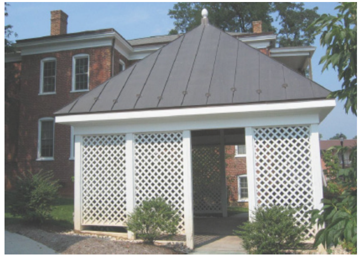
With diagonal lattice cladding and a hipped, standing-seam metal roof, this structure hides refuse containers from view.

Mechanical equipment is placed to the rear of the building and screened with a material similar to that found on the site's primary structure.