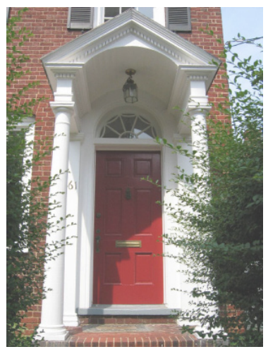
A pendant light fixture attached to the curved underside of this portico illuminates the entrance.