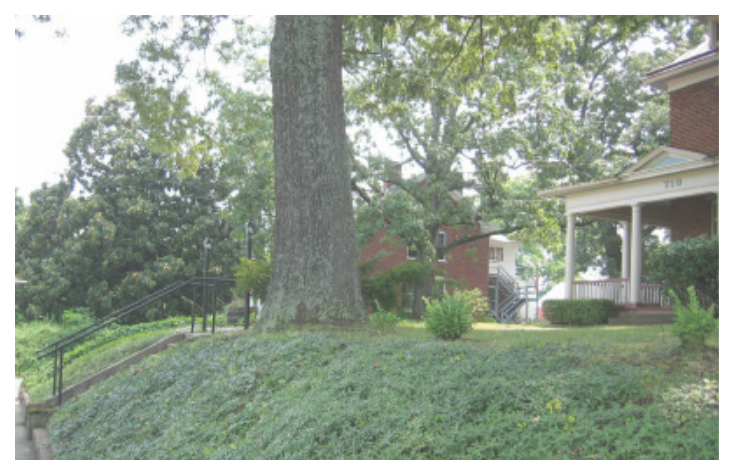
Common to many neighborhoods in Charlottesville, the deep setback of this house provides a setting for a planted buffer near the street, large site trees and a yard with accent plantings.