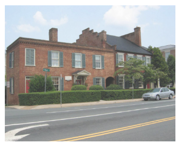
Even on an urban lot with a shallow setback, the opportunity exists for site plantings, such as this edge of hedge on West Main Street.

Mature plantings and trees dominate the setting of this large dwelling while the historic iron fence defines and separates the public realm from the private site.