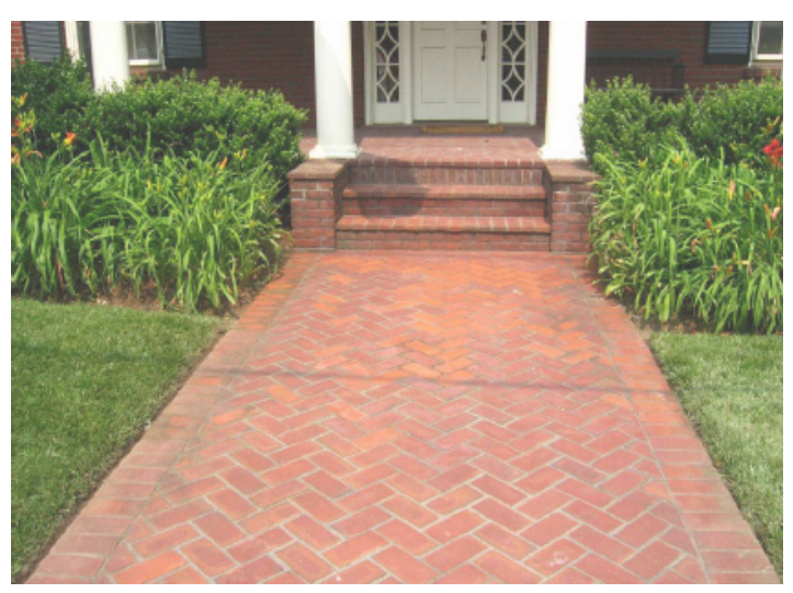
The use of brick laid in a herringbone pattern coordinates well with the dwelling's construction materials and traditional construction.