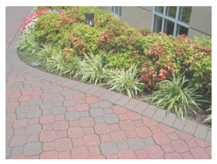
Interlocking concrete pavers laid in a traditional pattern may be appropriate for site walkways in historic district new construction.