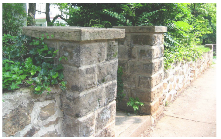
A low stone wall accented with evergreen plantings provides a historically appropriate border between a private lot and the sidewalk.