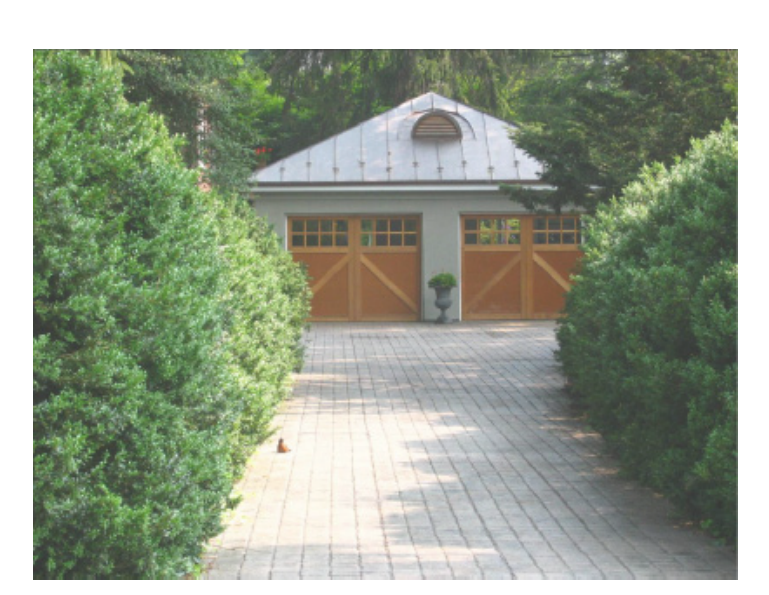
Accessed from a side street, this double garage with hipped, standing-seam metal roof is accessed using a driveway paved in stamped concrete. Its paint scheme coordinates with the dwelling on the lot.

This historic double garage with tile roof, placed at the rear of a deep city lot, retains its integrity although it has been renovated for alternate purposes since the house to which it related no longer survives.