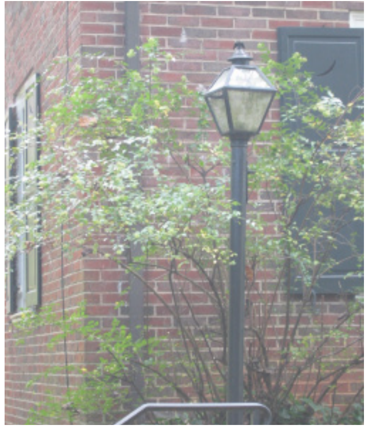
Traditionally styled, pole-mounted light fixtures are an appropriate way to provide site lighting for many historic residences.