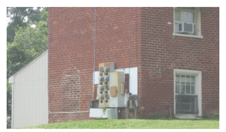
Strategically placed plantings would screen the view of this utility area from passerbys in this residential neighborhood.