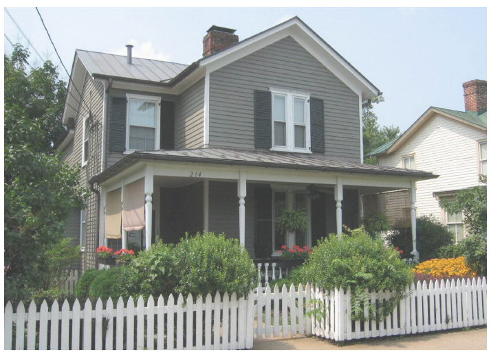
A low, wood, picket fence coordinates with the materials used in the consturction of the house as well as the paint color of the trim.