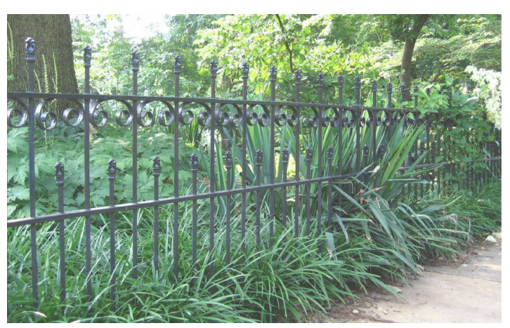
An ornate Victorian iron fence with low plantings adorns this lot line while not obscuring the view of the house and yard beyond.