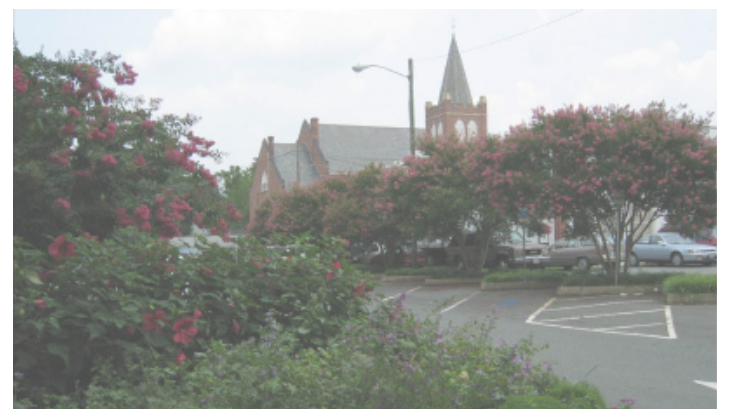
A planted island softens the impact of this asphalt parking lot in a historic district.