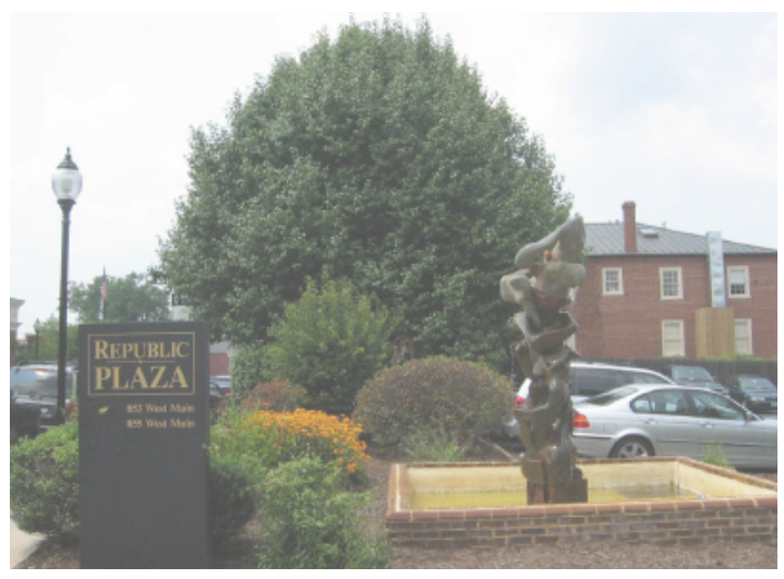
A planted entrance with directional signage and sculptural fountain provides a buffered gateway to this parking lot.