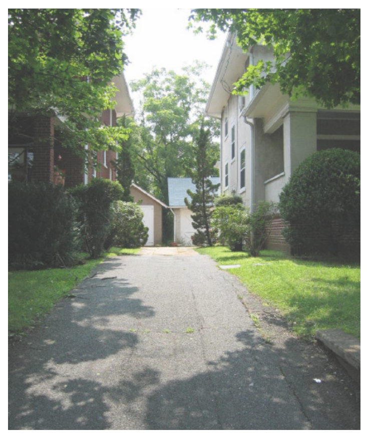
This older asphalt driveway provides shared access to appropriately placed garages at the rear of these residential lots.