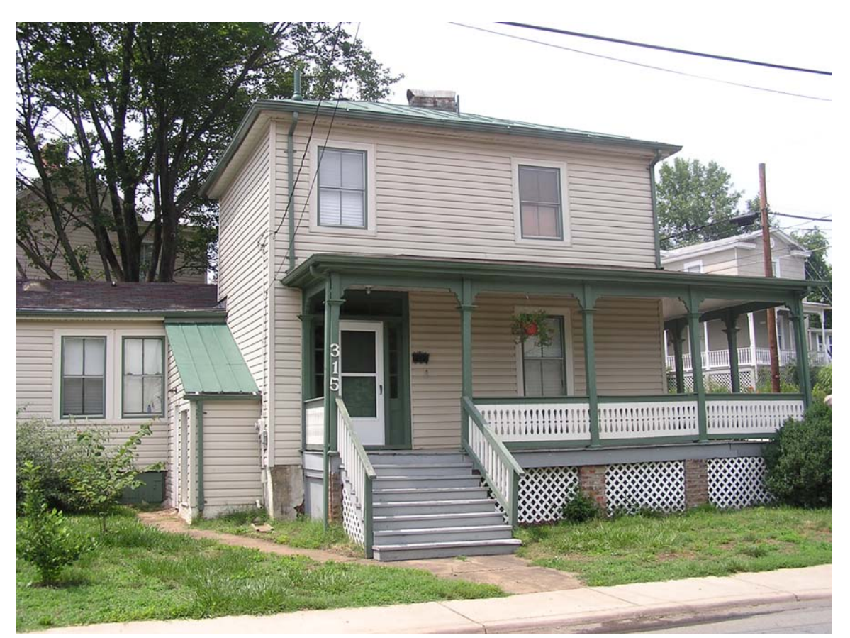
Primary Resource Information: Single Dwelling , Stories 2.00 , Style: Other, ca 1890 July 2006: This 2-story, 2-bay, hip-roofed, vernacular frame dwelling was constructed during the late 19th century. The walls are clad in vinyl siding but the roof maintains its standing-seam metal covering. The 2/2-sash windows, 3-light transom and 3-light sidelights around the door, interior brick chimney with corbelled cap, and overhanging eaves are original. The 7-bay wraparound porch, supported by chamfered posts, has sawn brackets, a sawn balustrade, and is supported by a brick pier foundation with lattice infill. The house has a 1-story, gable-roofed side wing with enclosed front porch that is set back from the front section. A shed-roofed bay is located along the side of the main block and may provide access to a crawl space.