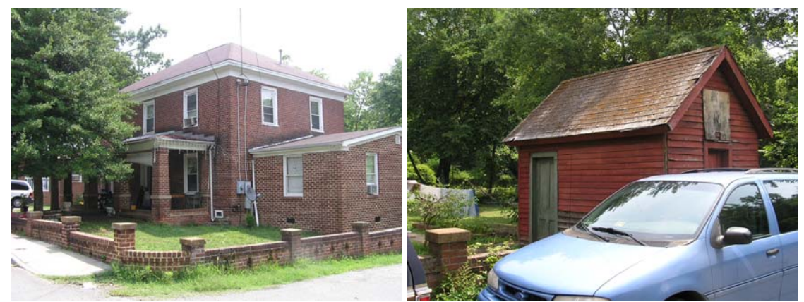
Primary Resource Information: Single Dwelling, Stories 2.00, Style: Colonial Revival, ca 1910

July 2006: This 2-story, 3-bay, double-pile, hip-roofed vernacular brick dwelling appears to have been constructed ca. 1910 and contains architectural elements of the Colonial Revival style. The walls are laid in 5-course American bond, which is rare for a post-bellum building and is usually seen on ones from the first half of the 19th century. The roof is clad in asphalt shingles and there is no evidence of a chimney. A plain brick frieze that has been painted white is protected by the overhanging eaves. The 1/1-sash windows appear to be modern replacements. The front door has a transom above whereas the sidelights have been enclosed. A 3-bay, hip-roofed front porch has square brick posts on brick piers and a low brick wall. A side 1-story, 1-bay, gable-roofed, brick ell extends to the south.