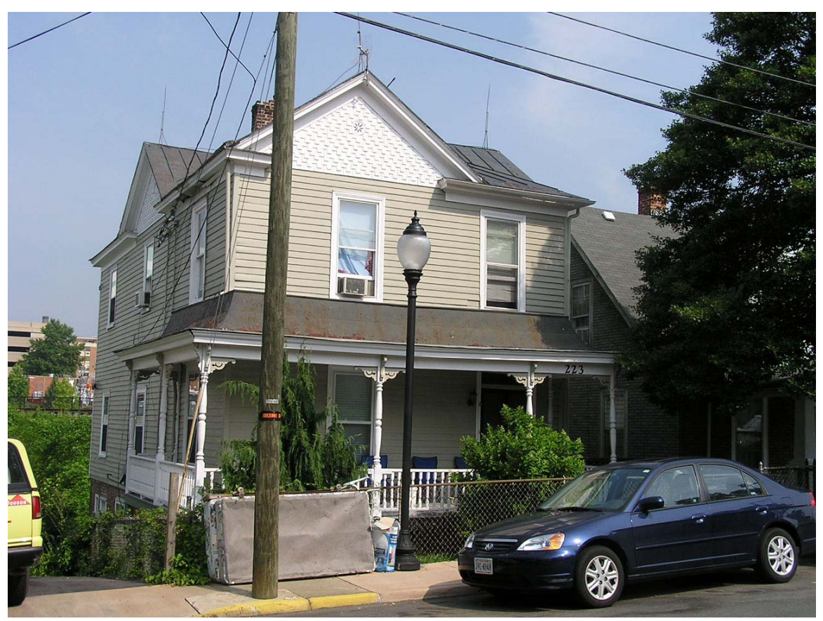
Primary Resource Information : Single Dwelling , Stories 2.00 , Style: Other, ca 1900 July 2006: This 2-story, 2-bay, hip and cross-gable-roofed, side-passage-plan, frame dwelling features a hipped roof with cross gables and was constructed ca. 1890. The house rests on a brick foundation and features a central brick chimney, standing-seam metal roofing, weatherboard siding, 1/1-sash windows, a plain frieze, wood shingles and round attic vents in the gable end, gable-end returns, a double-leaf front door with single-light transom, and a rear 1-story hip-roofed wing. The 5-bay wraparound front porch features turned spindles, turned balusters, sawn brackets, and a Mansard roof.