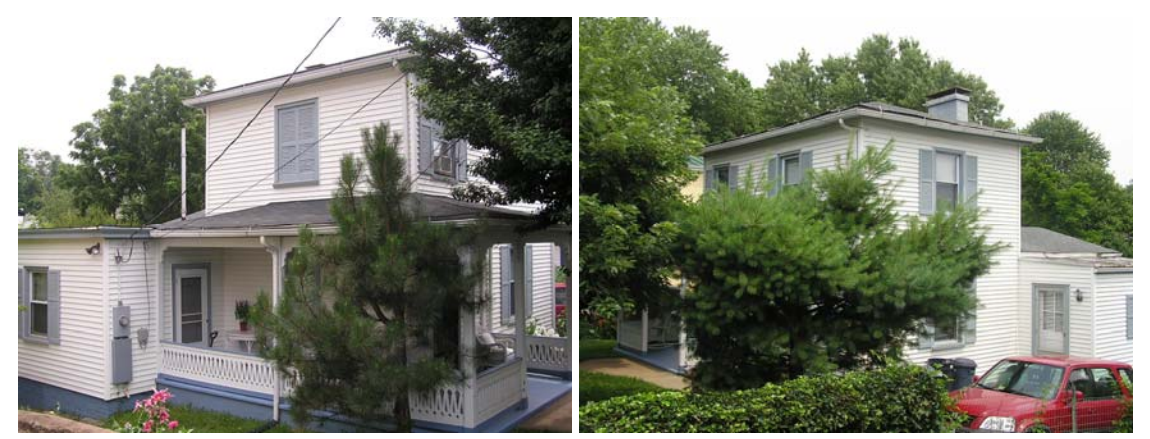
Primary Resource Information: Single Dwelling , Stories 2.00 , Style: Other, ca 1895 July 2006: This 2-story, 2-bay, hip-roofed, vernacular frame dwelling was constructed during the late 19th century. The walls are clad in vinyl siding and the roof in asphalt shingles. The 1/1 windows are modern but the 2-light transom over the door, exterior parged brick chimney on the rear wall, and overhanging eaves are original. A second-story opening on the north side has closed shutters and may be a blind window. The 4-bay wraparound porch is supported by chamfered posts with sawn brackets and a sawn balustrade and wraps around the north side of the house to join the front section to a side/rear 1-story wing that contains a door out onto the porch. The house has a 1-story, gable-roofed rear wing with numerous side lean-to additions.