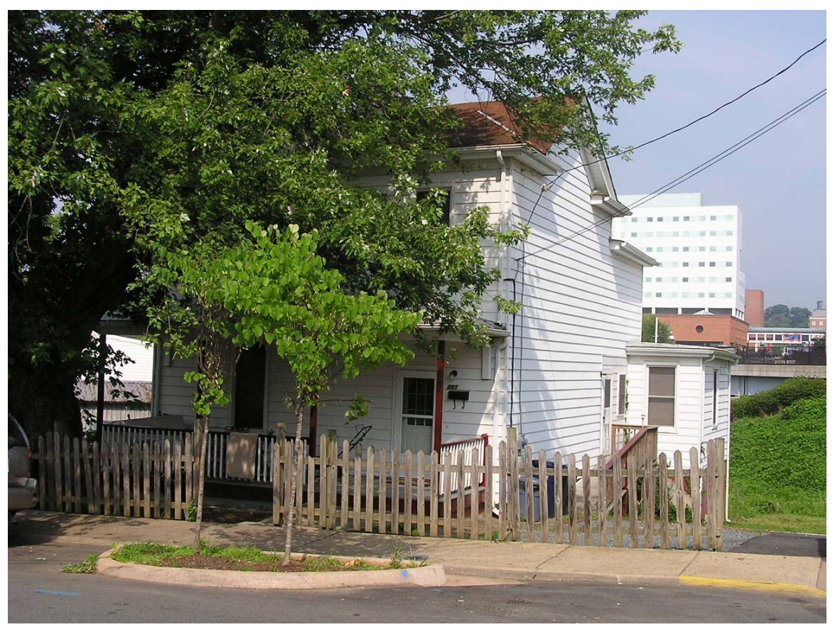
Primary Resource Information : Single Dwelling , Stories 2.00 , Style: Other, ca 1890 July 2006: This 2-story, 2-bay, hip and cross-gable-roofed, side-passage-plan, frame dwelling features a hipped roof with cross gables and was constructed ca. 1890. The house rests on a parged brick foundation and features a central parged chimney, asphalt shingle roofing, aluminum siding, 1/1-sash windows, a plain frieze, gable-end returns, a 2-story rear wing and a rear 1-story gable-roofed wing with enclosed side porch. The 3-bay, hip-roofed front porch is supported by square posts.