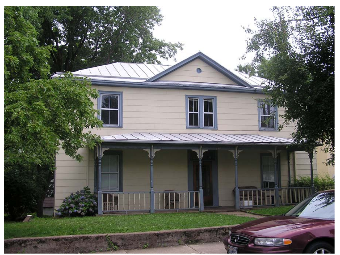
Primary Resource Information : Single Dwelling , Stories 2.00 , Style: Other, ca 1895 July 2006: This late-19th-century, 3-bay, 2-story frame I-house features a central-front gable, a brick foundation, asbestos siding, and a standing-seam metal hipped roof. The 2/2-sash windows are replacements, but the central brick chimney, pedimented front gable with round attic vent, overhanging eaves, and 2-light transom above the front door appear original. The 5-bay, hip-roofed front porch features turned spindles, sawn brackets, and a plain balustrade. The second-story, central-bay window on the façade features a paired 2/2 sash. The house features a rear 2-story hip-roofed ell with side and rear additions.