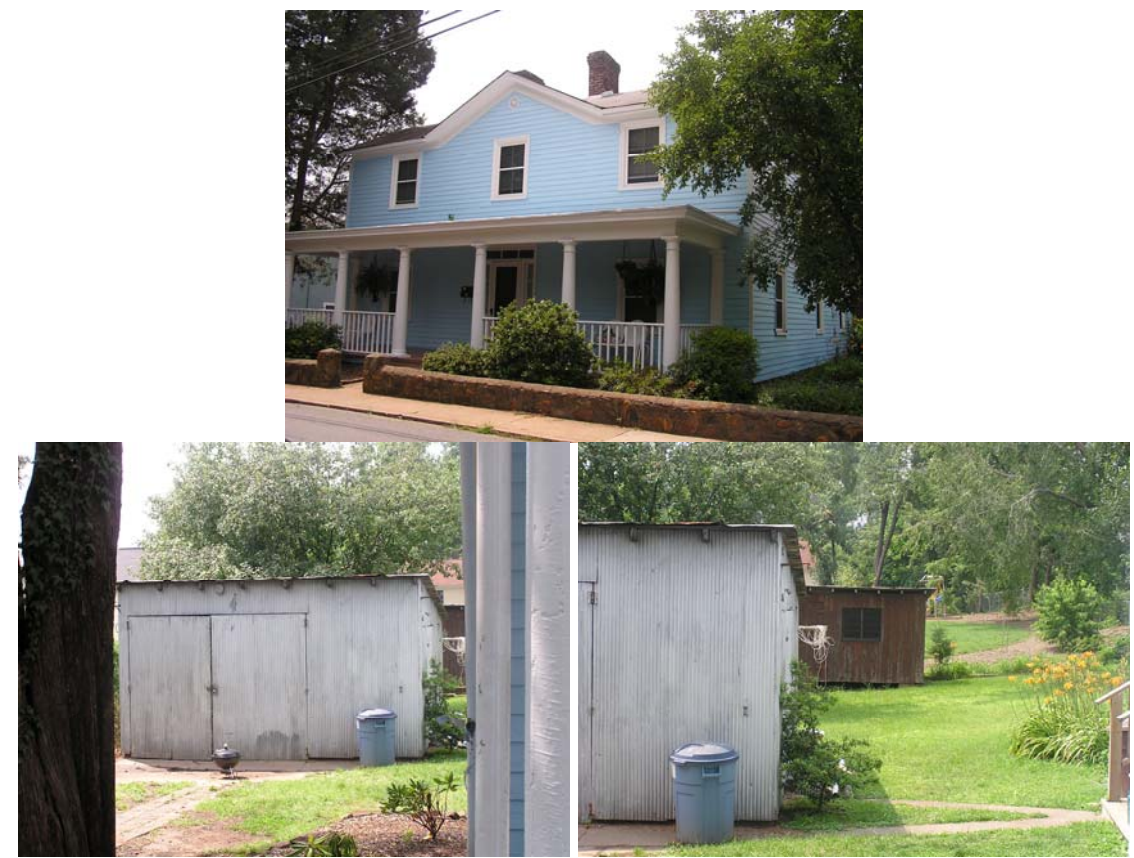
Primary Resource Information : Single Dwelling , Stories 2.00 , Style: Other, ca 1895 July 2006: This late-19th-century, 3-bay, 2-story frame I-house features a central-front gable, a brick foundation, weatherboard siding, and an asphalt-shingled gabled roof. The 2/2-sash windows are replacements, but the two central brick chimneys, central-front gable with round attic vent, overhanging eaves, plain frieze, and 3-light transom and sidelights around the front door appear original. The 5-bay, hip-roofed front porch features Tuscan columns and a plain balustrade. A 1-story wing extends to the rear.