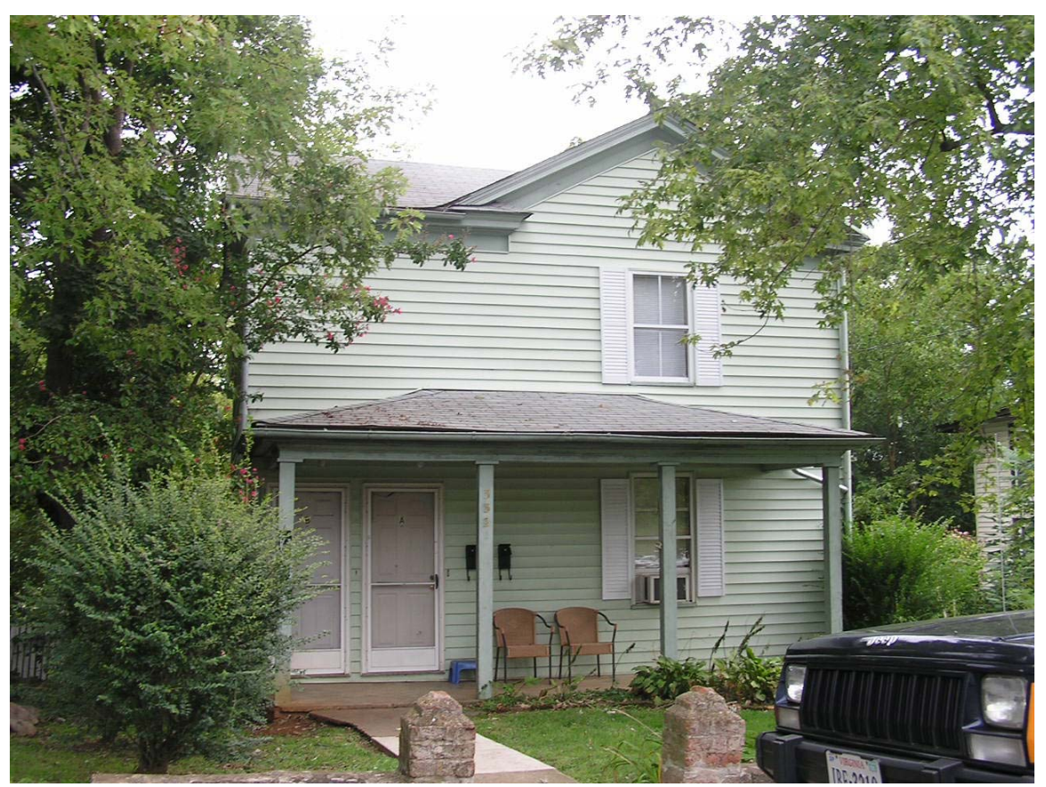
Primary Resource Information: Single Dwelling, Stories 2.00, Style: Other, ca 1900 July 2006: This 2-story, 3-bay, frame dwelling features a hipped roof with cross gables. It was originally a side-passage-plan, 2-bay wide building, but an extra front door has been added, converting it into a duplex. Other alterations include a roof clad in asphalt shingles and walls covered in vinyl siding. Constructed ca. 1900, the house has a central interior brick chimney, a parged foundation, modern vinyl 2/2 windows, overhanging eaves, a plain friezeboard, and gable end returns. A 2-story wing on a concrete block foundation extends off the rear ell. The 3-bay, hip-roofed front porch has square supports. Individual Resource Status: Single Dwelling Contributing Total: 1