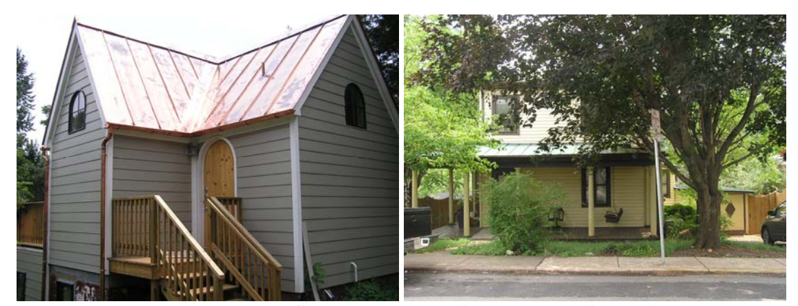
Primary Resource Information : Single Dwelling , Stories 2.00 , Style: Other, ca 1900 July 2006: This 2-story, 2-bay, hip-roofed, vernacular frame dwelling was constructed during the late 19th century. The walls are clad in vinyl siding but the roof is covered in standing-seam metal and the house maintains original 2/2-sash windows, a transom over the door, a central brick chimney, and overhanging eaves. The 6-bay wraparound porch is supported by Tuscan columns and wraps around the north side of the house to join the front section to a rear wing that contains a door out onto the porch. The house has a 2-story rear wing on a raised basement and an attached shed-roofed garage wing on the south side.

Individual Resource Status: Single Dwelling Contributing Total: 1 Individual Resource Status: Single Dwelling Non-Contributing Total: 1