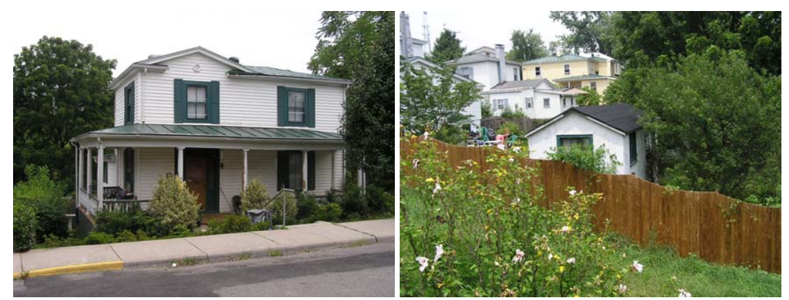
Primary Resource Information : Single Dwelling , Stories 2.00 , Style: Other, ca 1900 July 2006: This 2-story, 2-bay, side-passage-plan frame dwelling features a hipped roof with a front cross gable. Constructed ca. 1890, the house has an exterior brick chimney on the rear wall, a standing-seam metal roof, vinyl siding, vinyl shutters, 2/2-sash wood windows, and a transom and sidelights around the front door. A 6-bay wrap around porch is supported by Tuscan columns and has turned balusters and a denticulated cornice. A 1-story, gable-roofed frame wing extends to the rear and features a side porch with sawn balustrade.

Individual Resource Status: Single Dwelling Contributing Total: 1 Individual Resource Status: Shed Contributing Total: 1