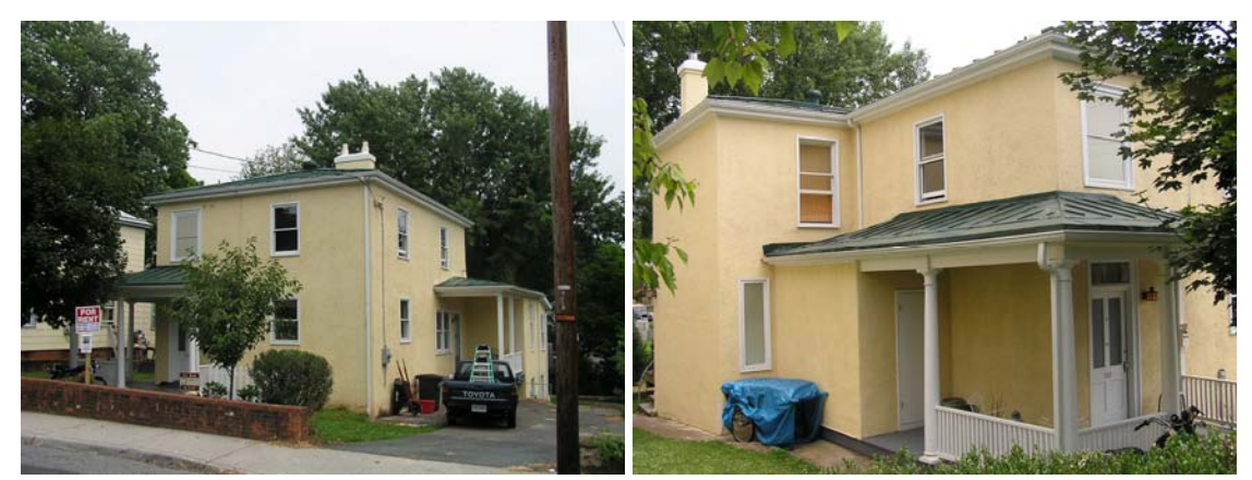
Primary Resource Information: Single Dwelling , Stories 2.00 , Style: Other, ca 1890 July 2006: This 2-story, 2-bay, hip-roofed, vernacular frame dwelling was constructed during the late 19th century. The walls have been stuccoed and the roof is covered in modern standing-seam metal with ridge vents. The 1/1 windows are replacements but the transom over the door, exterior parged brick chimney on the rear wall, and overhanging eaves are original. The 4-bay wraparound porch, supported by Tuscan columns, has plain pickets and wraps around the north side of the house to join the front section to a side/rear 2-story wing that contains a door out onto the porch. The house has a 1-story, hip-roofed rear and side wing with side porch.