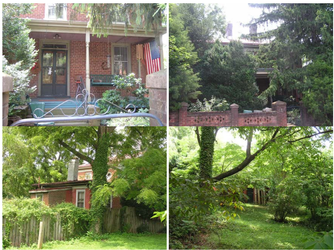
Primary Resource Information: Single Dwelling, Stories 2.00, Style: Late Victorian, ca 1897

July 2006: Constructed in 1897, this 2-story, 3-bay, brick, vernacular I-house features some Victorian decorative elements. The hip-roofed house has a standing-seam metal roof and the brick walls are laid in a 6-course-American-bond pattern. The house has not been greatly altered and includes: 2/2-sash wood windows with wooden sills and molded surrounds, a double-leaf, wood and glass front door comprised of a tall pane of glass surrounded by small panes of stained glass; a 2-light transom above the doors; a plain brick frieze; two central interior brick chimneys with corbelled caps; a round stained-glass window on the second-floor, center bay of the rear elevation; and a 1-story, hip-roofed, rear brick wing with two interior chimneys and a plain brick frieze. The 3-bay, hip-roofed front porch has turned posts, a wooden floor, and no balustrade.