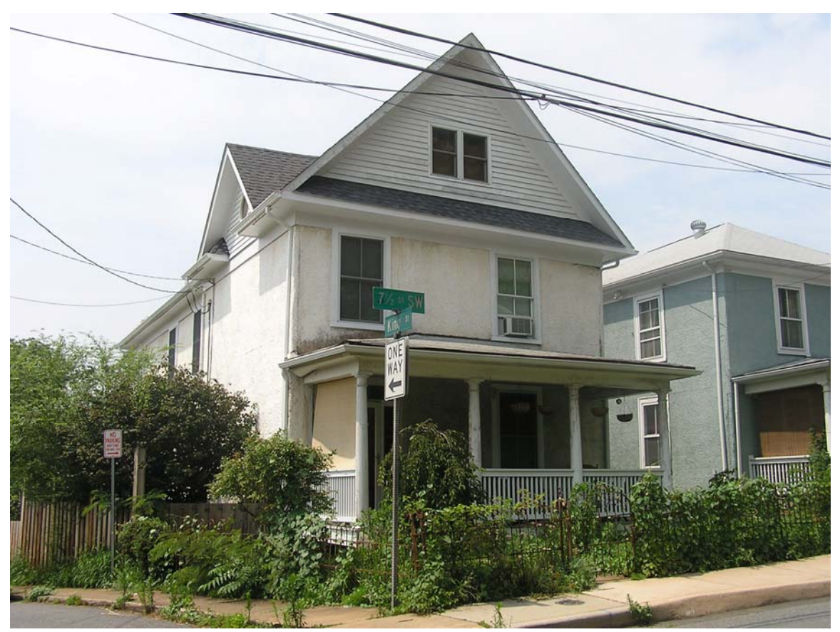
Primary Resource Information: Single Dwelling, Stories 2.00, Style: Other, ca 1890 July 2006: This late-19th-century, 2-story, 2-bay, vernacular side-passage-plan dwelling has a very tall, pedimented, gable-end front with paired attic windows. The house has stuccoed walls and an asphalt-shingled cross-gabled roof. The house has a plain frieze, 2/2-sash windows, gable-end returns, a 3-light transom and sidelights around the door, and a 3-bay front porch with Tuscan columns and plain pickets. A 2-story wing extends off the rear 2-story ell. The roof on this house may have been altered to its current configuration as it seems slightly out of proportion with the dimensions of the house.