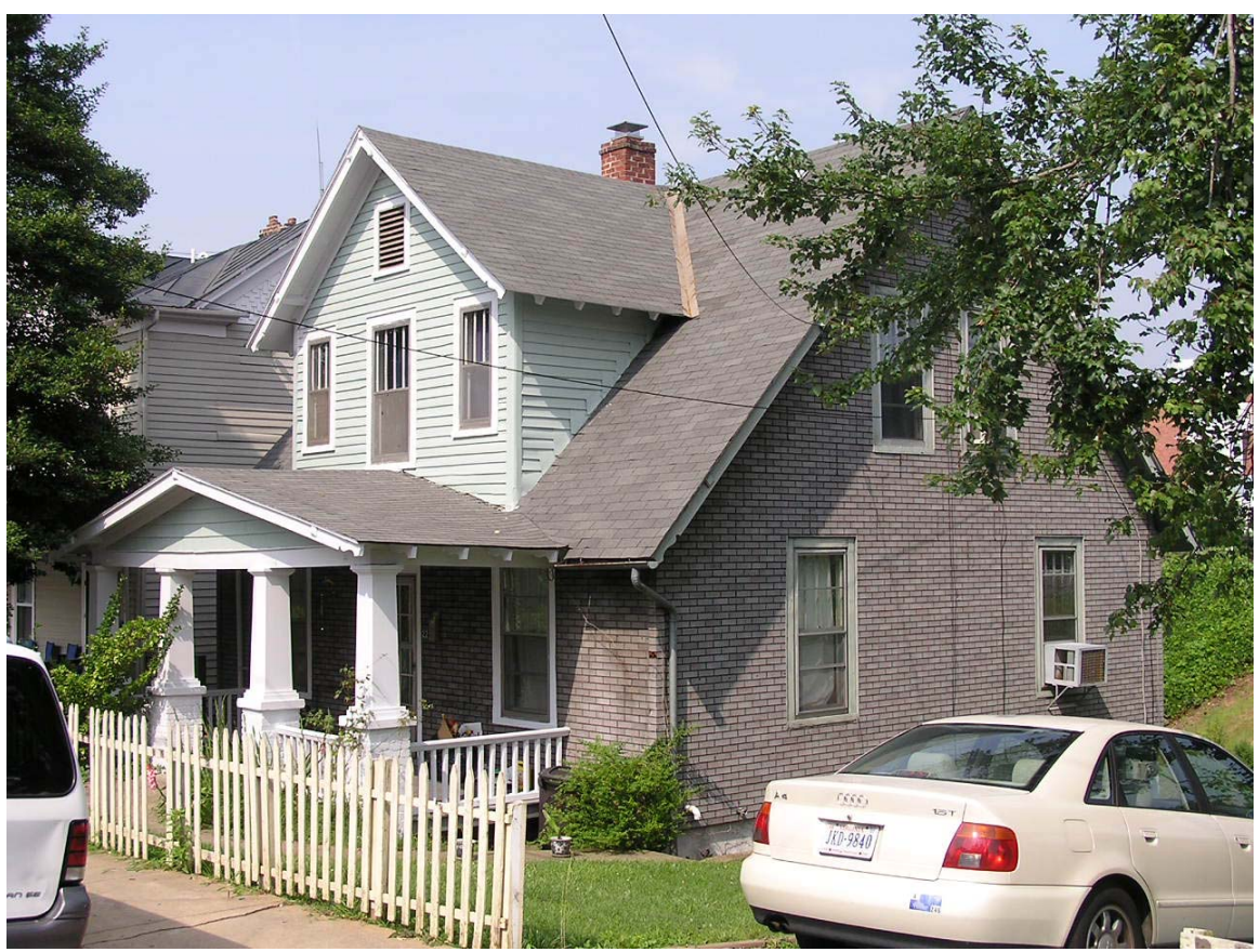
Primary Resource Information: Single Dwelling, Stories 1.50, Style: Bungalow/Craftsman, ca 1925

July 2006: This 1<sup>1</sup>/<sub>2</sub>-story, 3-bay, frame bungalow has a gable roof with a large gabled front dormer with weatherboard siding and three windows. Constructed ca. 1930, the house features a split level concrete foundation, bricktex siding, asphalt shingle roofing, interior brick chimney, overhanging eaves with exposed rafter and purlin ends, 4/1 windows, and a 3-bay gabled porch with battered wood columns on brick piers.