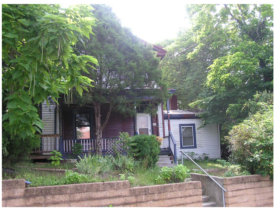
Primary Resource Information: Single Dwelling, Stories 2.00, Style: Other, ca 1886 July 2006: This 2-story, 2-bay, gable-end, vernacular frame dwelling was constructed ca. 1886 by Mrs. Lena King. The house rests on a brick foundation and has weatherboard siding and a standing-seam metal roof. Architectural details include gable-end returns, plain friezeboard, corner boards, a rectangular attic vent, 3-light transom, and a 1-story, 1-bay, hip-roofed side wing that extends past the rear of the main block of the house. Modern 1/1-sash windows replaced the original 6/6-sash. The 3-bay hip-roofed front porch has turned posts and plain pickets and incorporates a modern handicap ramp.