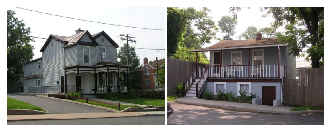
Primary Resource Information: Single Dwelling, Stories 2.00, Style: Other, ca 1885 July 2006: This 2-story, 2-bay, cross-gabled, frame vernacular dwelling with many Victorian details was constructed in 1885 by Jacob H. Nalls, a local building contractor. Clad in vinyl siding over the original German-lap siding, which is visible under the front porch, the house has a roof of standing seam metal. The house features a projecting front bay under the front porch and a projecting rectangular bay off the rear ell. Resting on a brick foundation, the house has interior brick chimneys with corbelled caps. The 2/2-sash vinyl windows are modern replacements. The 6-bay front porch, supported by turned posts, has segmental-arched bays that are formed by the double pierced two-stage frieze with Eastlake-style detailing. The bays of the porch around the bay window make a semioctagonal projection around the bay window. A small second-story gabled pavilion that appears to be a later addition is set on the roof of the porch over the entrance bay. Other details include pressed tin shingles in the front pedimented gable end, a plain bracketed frieze, and a modern front door. The rear 2-story wing has enclosed side porches and a rear 1-story lean to. The house is now used as offices for Dogwood Housing Ltd., who purchased the property in 1980.

Individual Resource Status: Single Dwelling Contributing Total: 1 Individual Resource Status: Single Dwelling Non-Contributing Total: 1