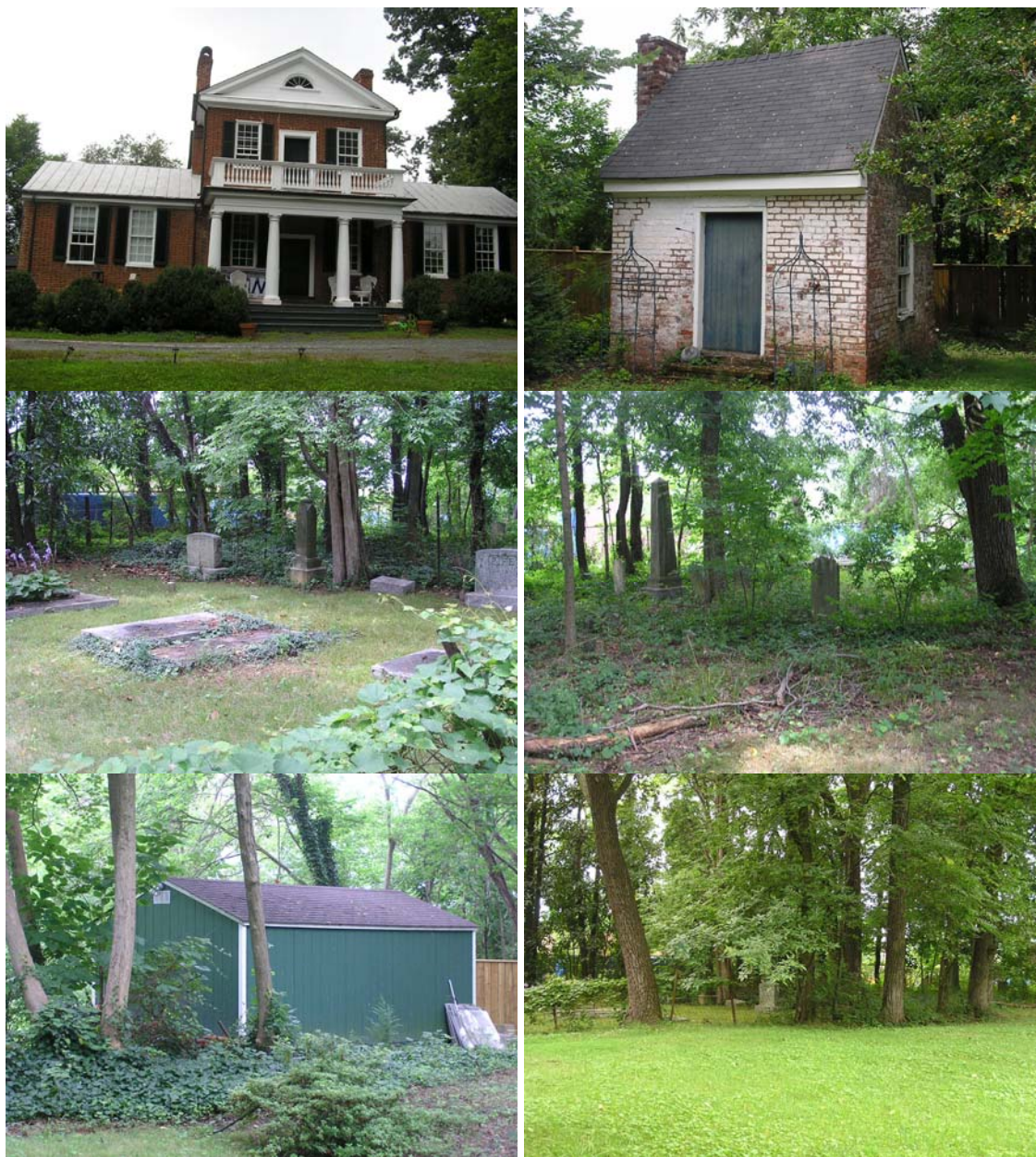
Primary Resource Information: Single Dwelling, Stories 2.00, Style: Early Classical Revival, 1822