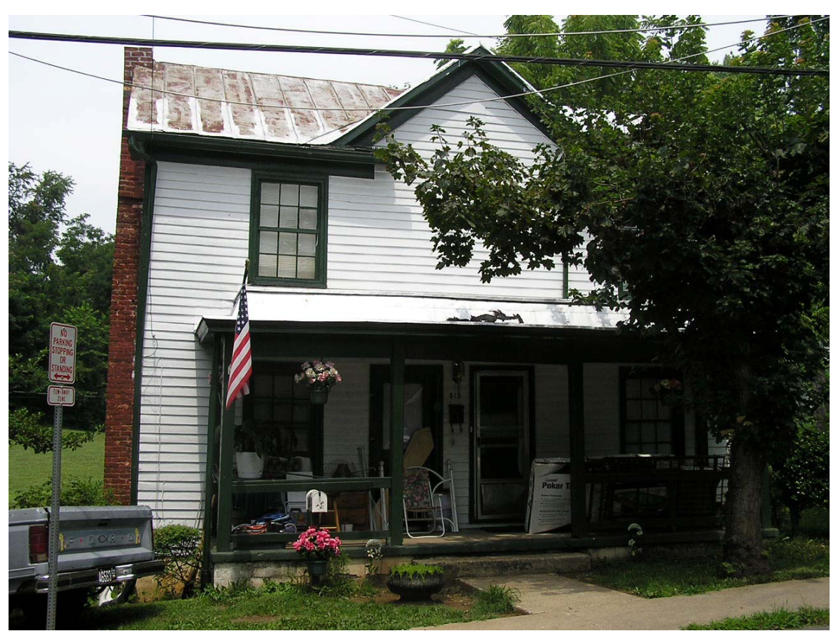
Primary Resource Information: Multiple dwelling, Stories 2.00, Style: Other, ca 1900

July 2006: This 2-story, 4-bay, gable-roofed vernacular I-house features two front doors and may have been constructed as a duplex. The house, clad in weatherboard siding, has a gabled roof with a central-front gable that is covered in standing-seam metal. An exterior brick chimney is located on the south gable end while an interior brick flue is located on the north gable end. Other details include a parged foundation, 6/6-sash windows, gable-end returns, a plain friezeboard, corner boards, 6/6-sash windows, and a rear 1-story hip-roofed wing with central brick chimney. The 3-bay, front porch has chamfered posts and a low Mansard roof.