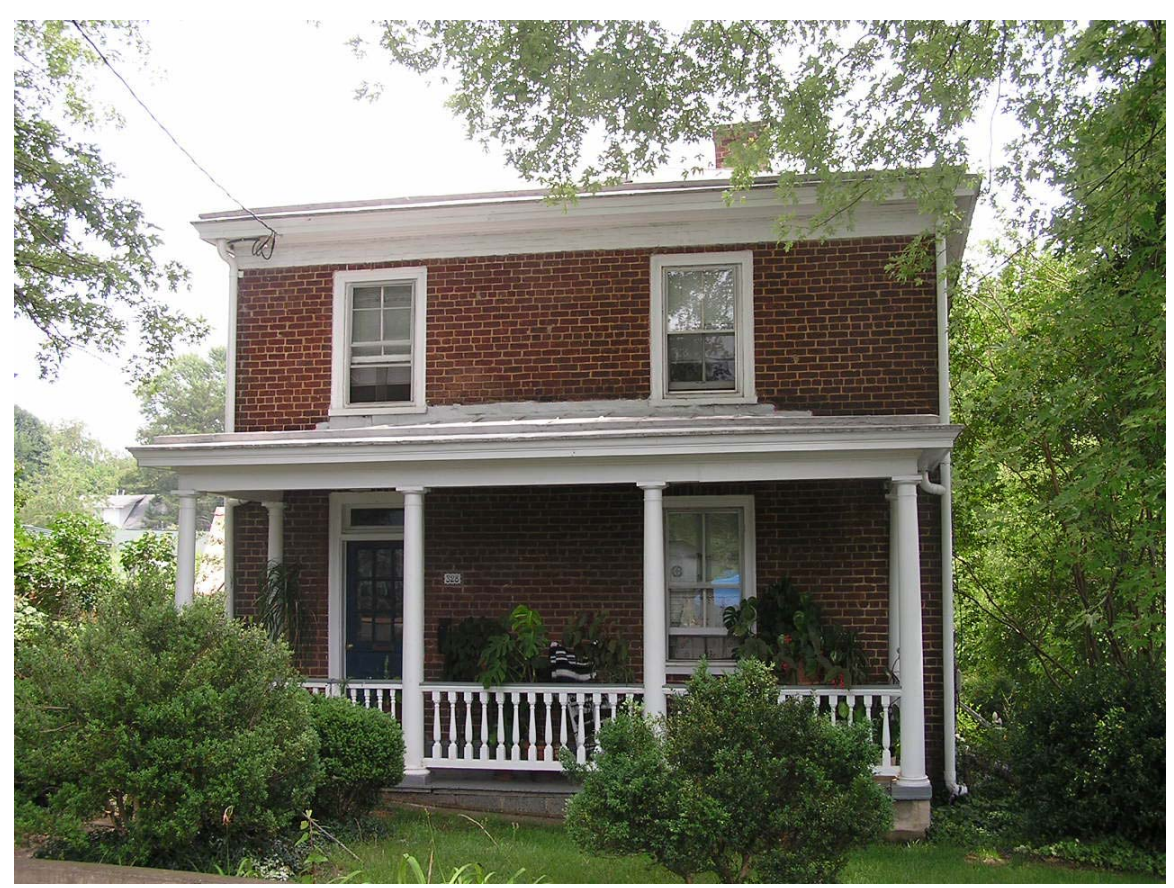
Primary Resource Information : Single Dwelling , Stories 2.00 , Style: Other, ca 1915 July 2006: This 2-story, 2-bay, hip-roofed vernacular brick side-passage-plan house was constructed ca. 1915. The brick walls are laid in 6-course American bond brick and a plain brick frieze that is painted white runs along the top of the walls. The house has 2/2sash windows, a transom over the door, a brick foundation, a central interior brick chimney, and overhanging eaves. The roof is covered in standing seam-metal. The 3-bay hip-roofed front porch has Tuscan column supports and turned balusters. A 1-story brick wing extends to the rear with a second-story frame addition and side 2-story frame wing to the wing.