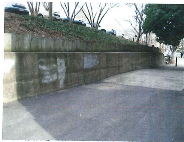
Fig 4 – view down wall toward 2 nd Street