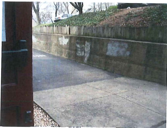
Fig 1 – view from side entrance