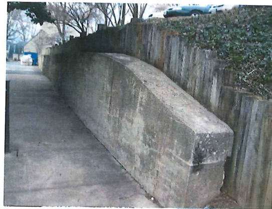
Fig 2 – view down wall coming from street.