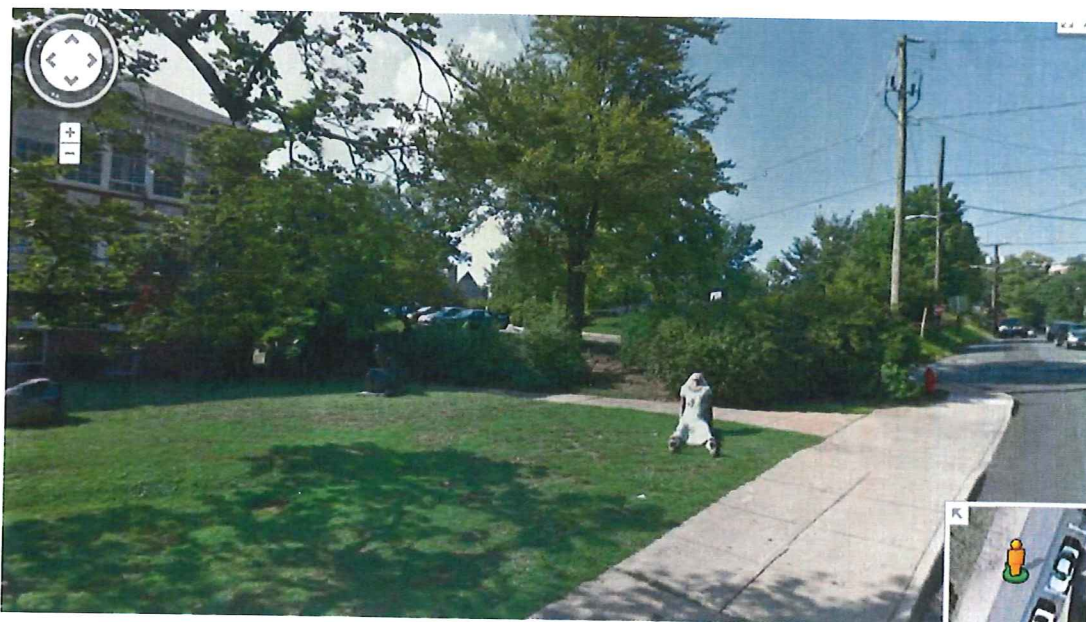
Fig 5 – view from 2 nd Street NW