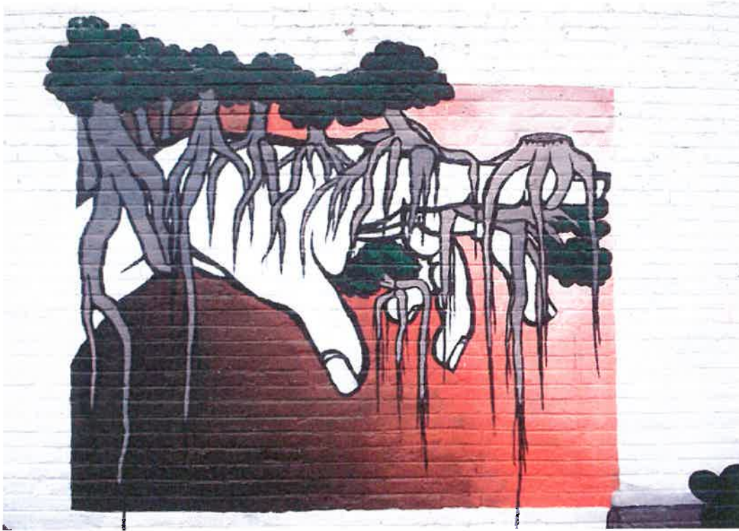
Plaza Art Store, Richmond VA. Approx. 8.5' tall x 7.5' wide