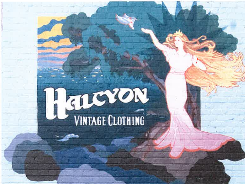
Halycon Vintage Store, Richmond VA. 80 sq ft. Halycon Vintage Store, Richmond VA. 80 sq ft.