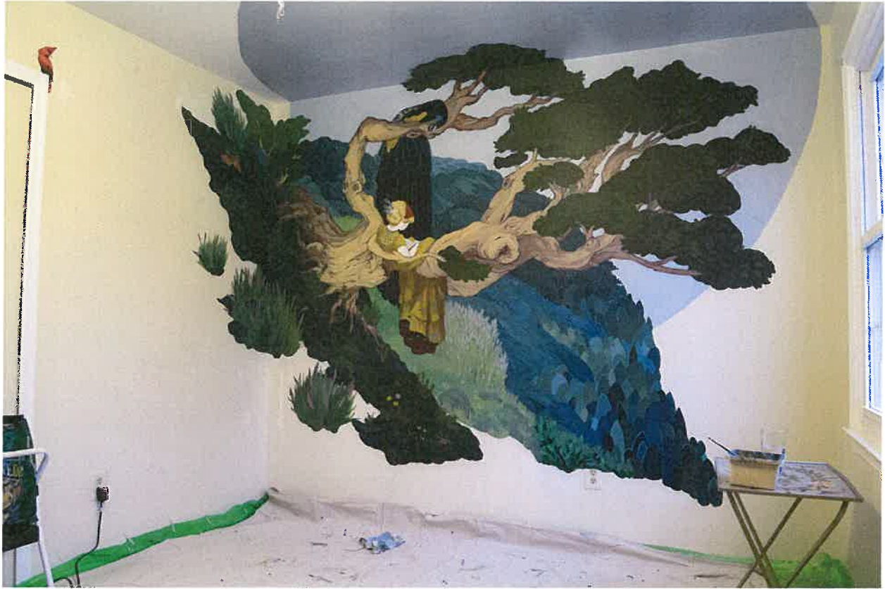
Fantasia Drive. Commissioned childrens wall mural. 9.5' x 13' (including sky circle)