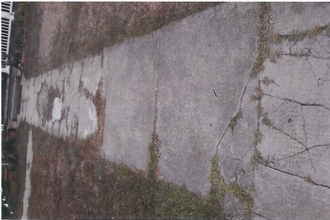
501 Budget Current walkway