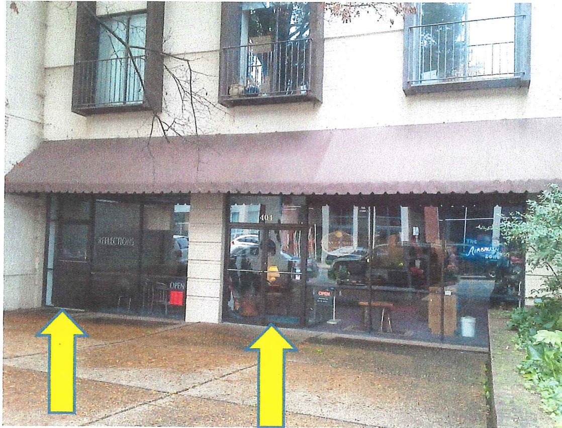
This is a view of 404 E. Market St. that has been divided into 2 retail locations with multiple doors facing Market St.