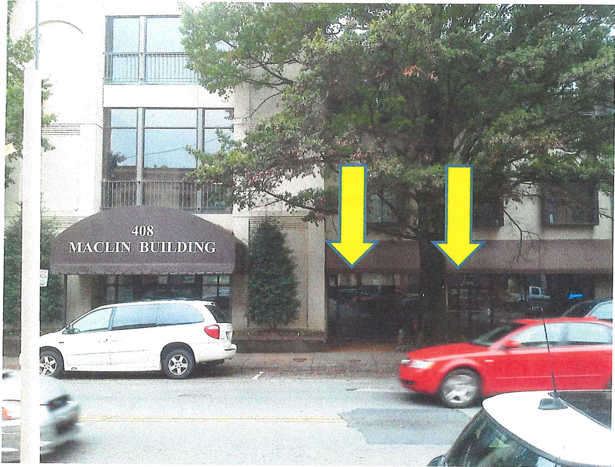
Existing door location at 404 E. Market St.