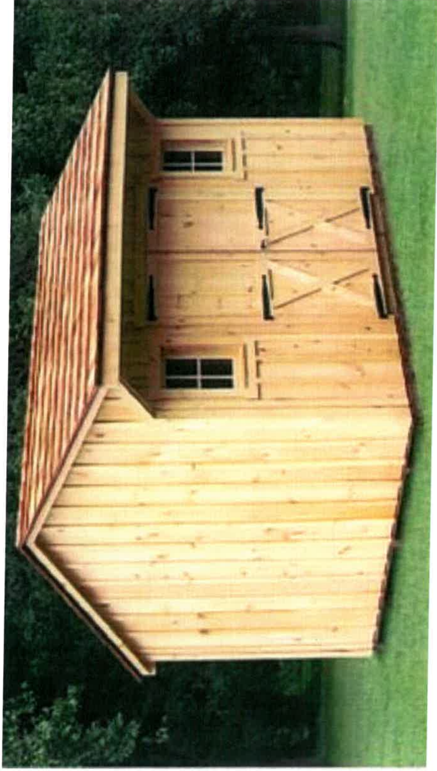
Proposed shed representative photo.