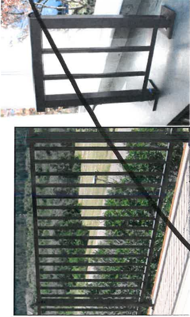
RAILING 'A' ||||| VERTICAL RAILING SYSTEM