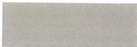
Flat Finish 105