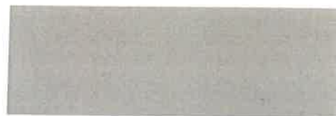
Low Lustre 103