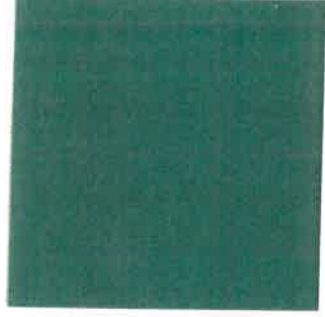
Crete Countryside Campo de Creta