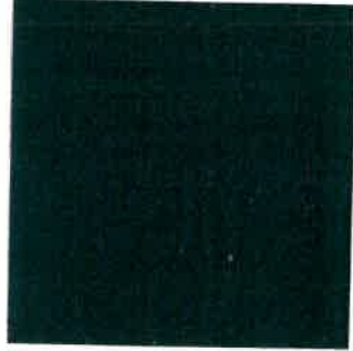
Tavern Door Puerta de Taberna