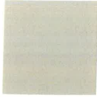
Pashmina AF-100 Pashmina