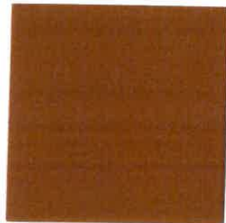
Riverbed Brown Marrón de Lecho