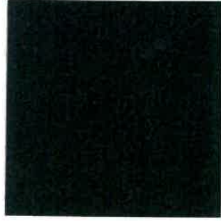
Blackened Moss Musgo Oscuro