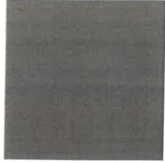
Fairview Taupe HC-85 Gris Pardo de Fairview