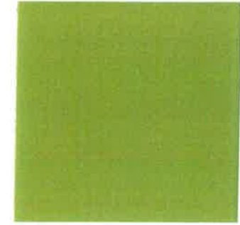
Jalapeno Pepper 2147-30 Jalapeno