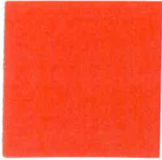
Claret Rose 2008-20 Vino de Borgoña