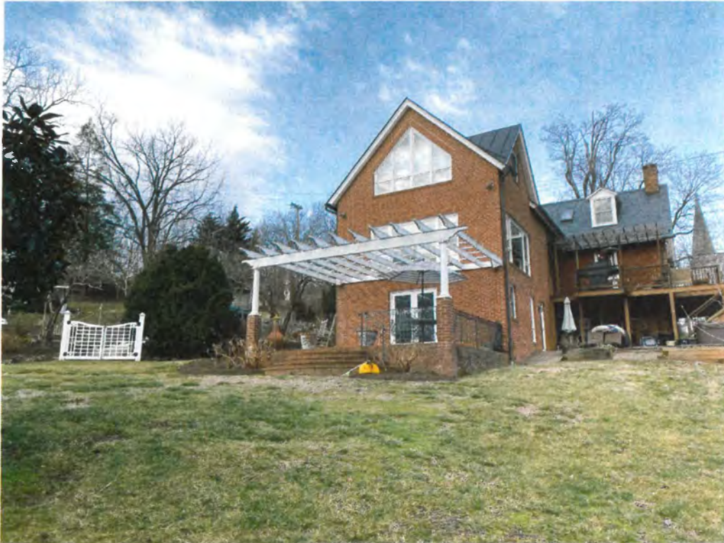
East and North Face