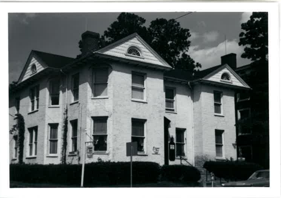
DABNEY HOUSE 301 MARKET ST.

Department of Community Development City Hall Charlottesville, Virginia 22902