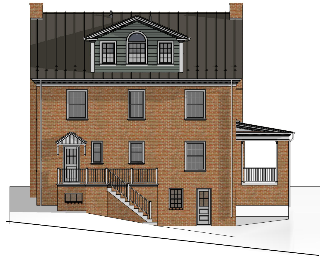
NORTH ELEVATION - June 21 6:00 PM