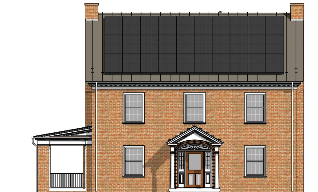
SOUTH ELEVATION - October 21 10:00 AM