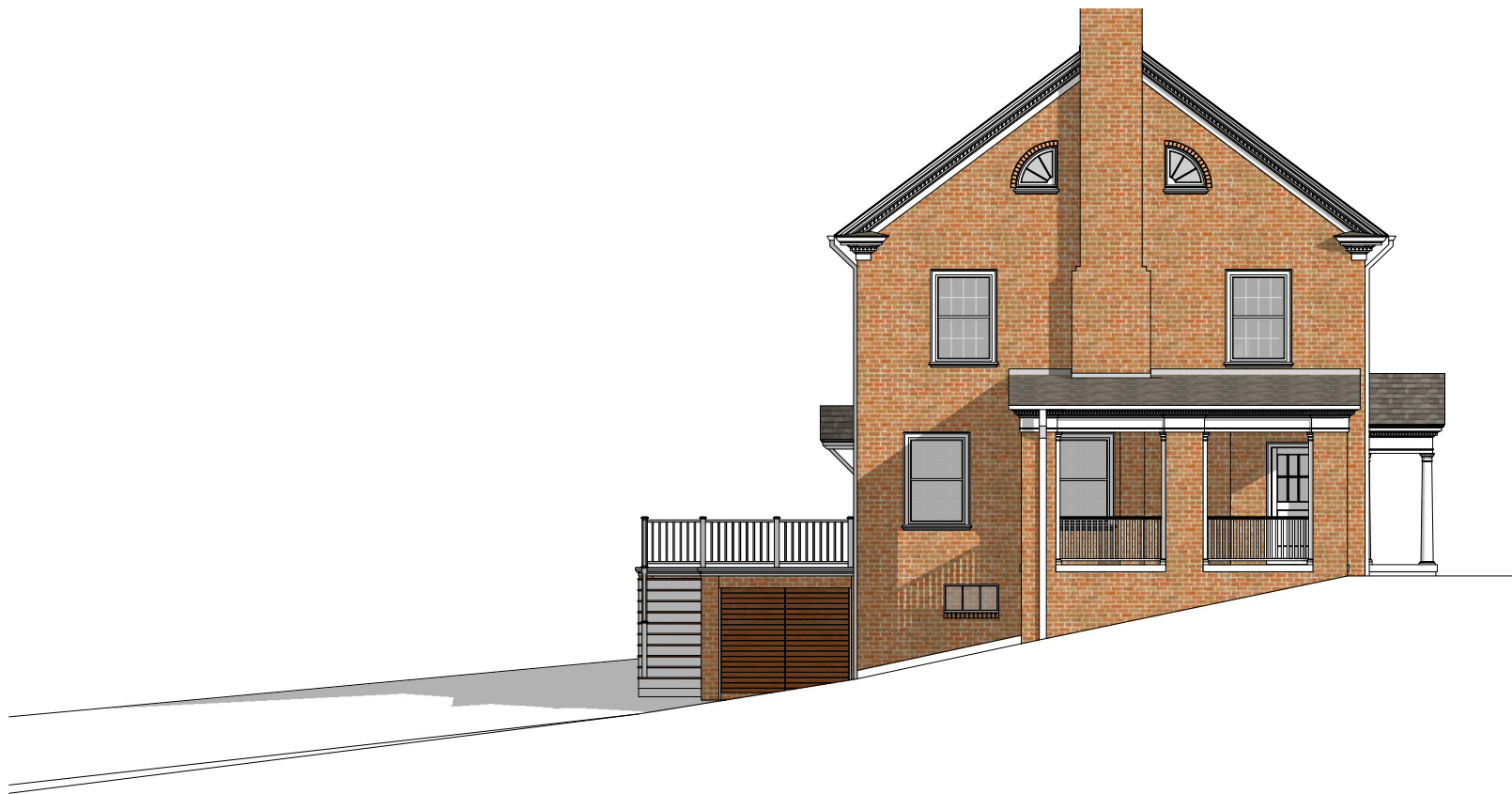
WEST ELEVATION - October 21 3:00 PM