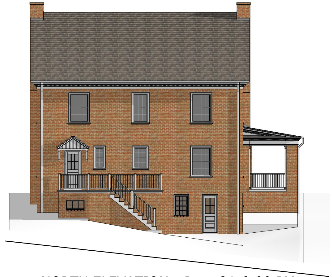
NORTH ELEVATION - June 21 6:00 PM