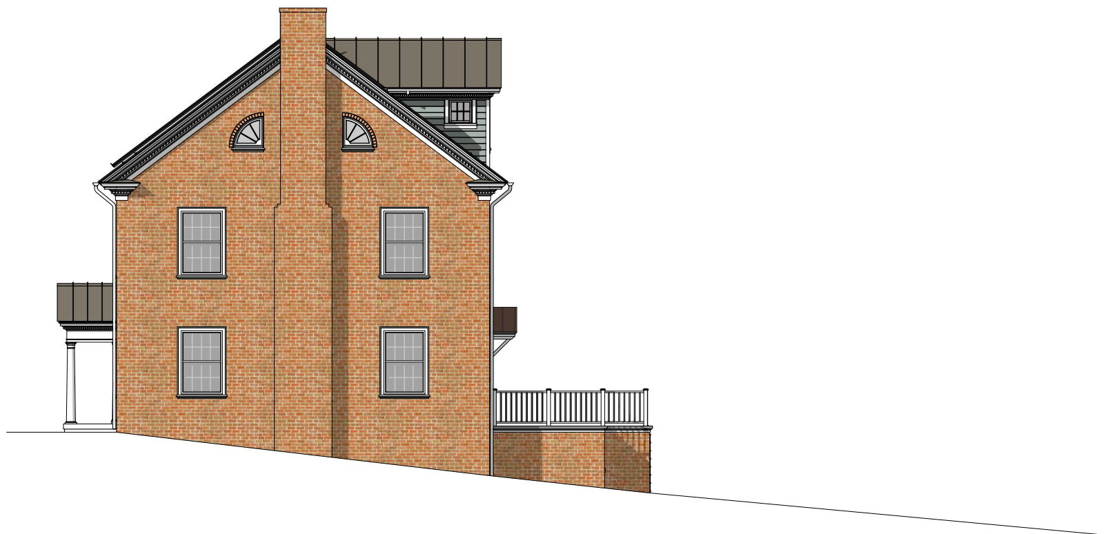
EAST ELEVATION - October 21 10:00 AM