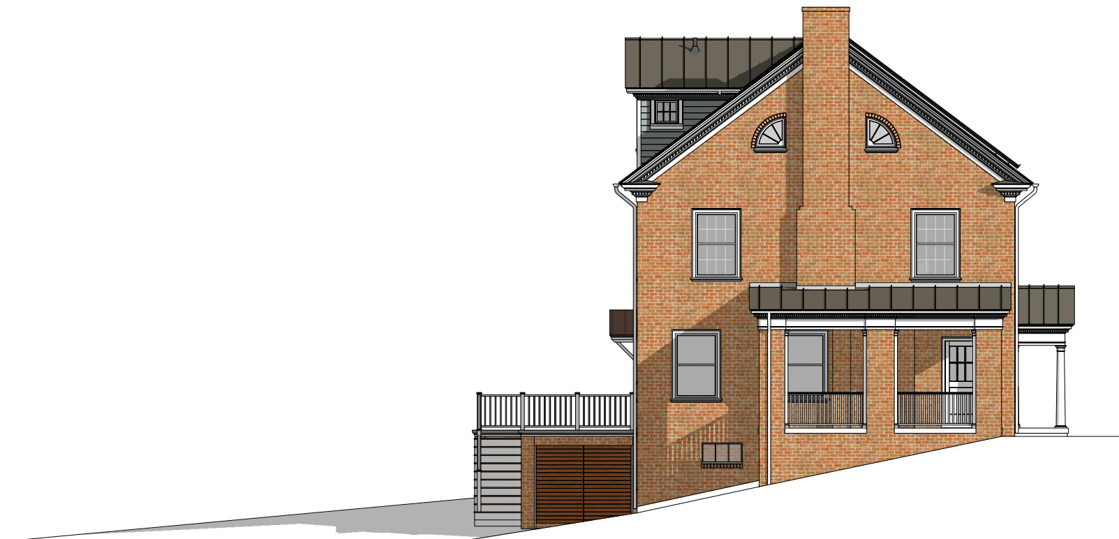
WEST ELEVATION - October 21 3:00 PM