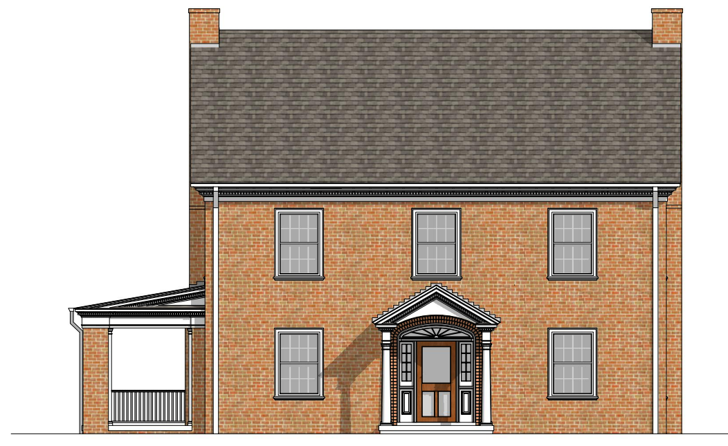
SOUTH ELEVATION - October 21 10:00 AM