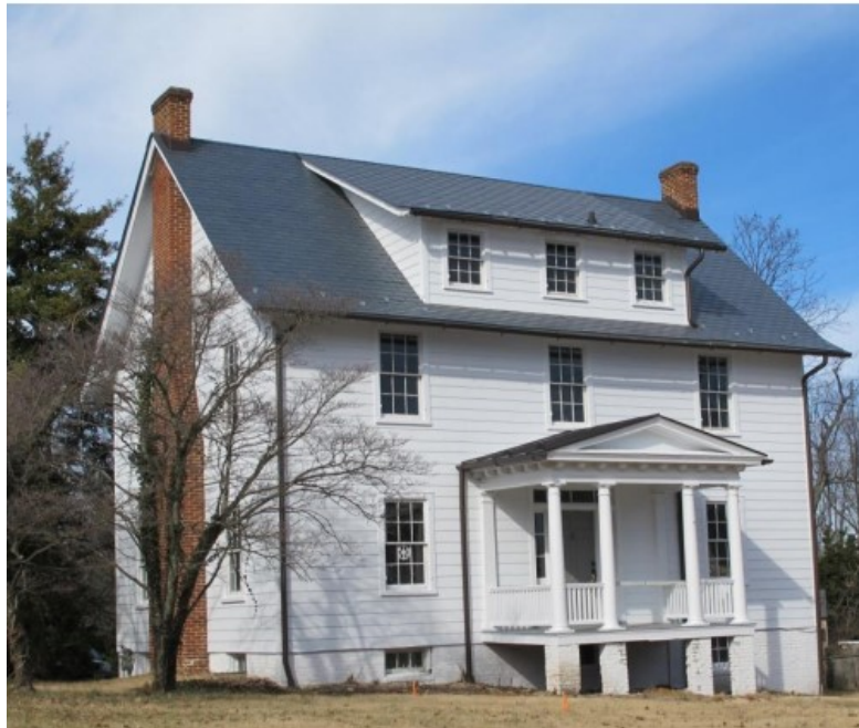
803 Rugby Road (1917)