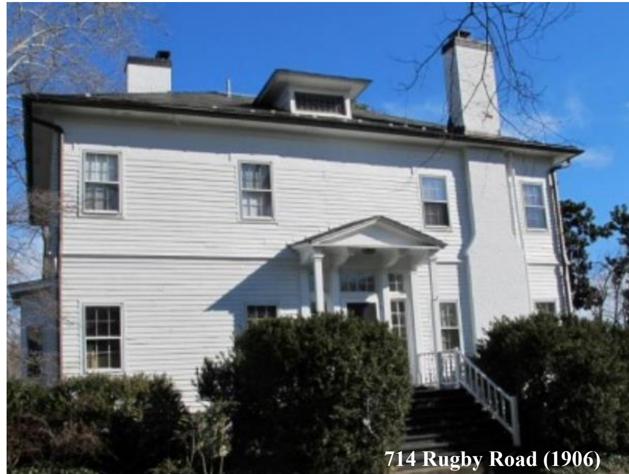
714 Rugby Road (1906)