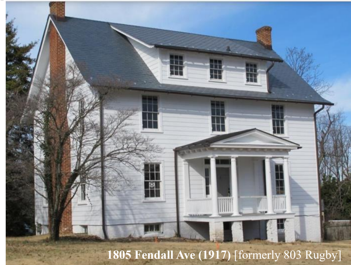
1805 Fendall Ave (1917) [formerly 803 Rugby]