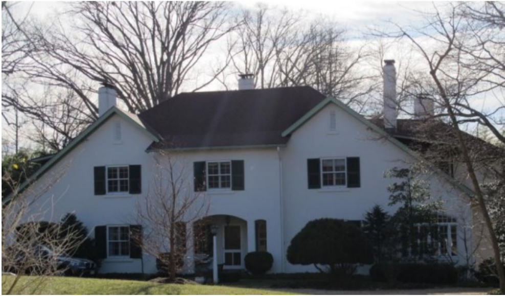
936 Rugby Road (1911)