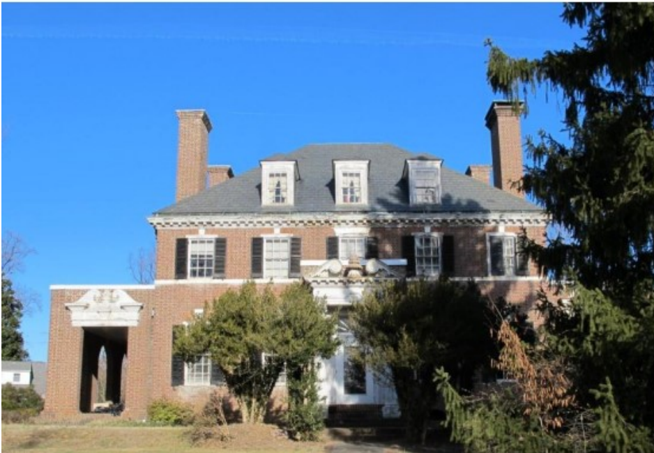
929 Rugby Road (1929)