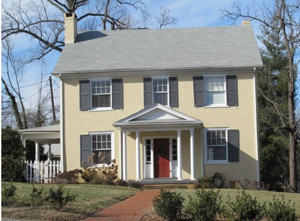
807 Rugby Road - front portico, BAR review 3-19-2024