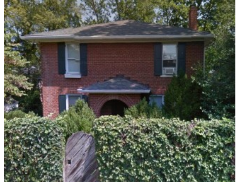
1801 Rugby Place (1929)