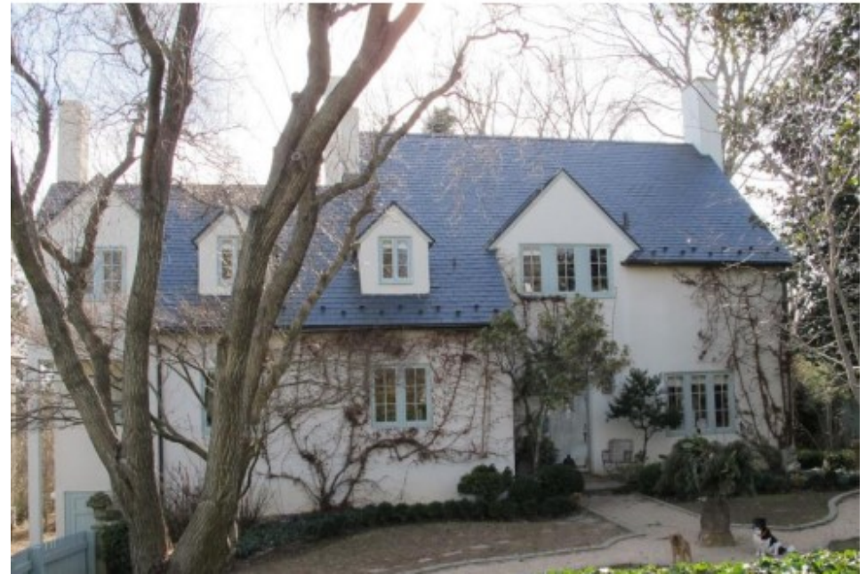
918 Rugby Road (1921)