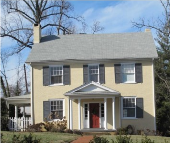
807 Rugby Road (1929)