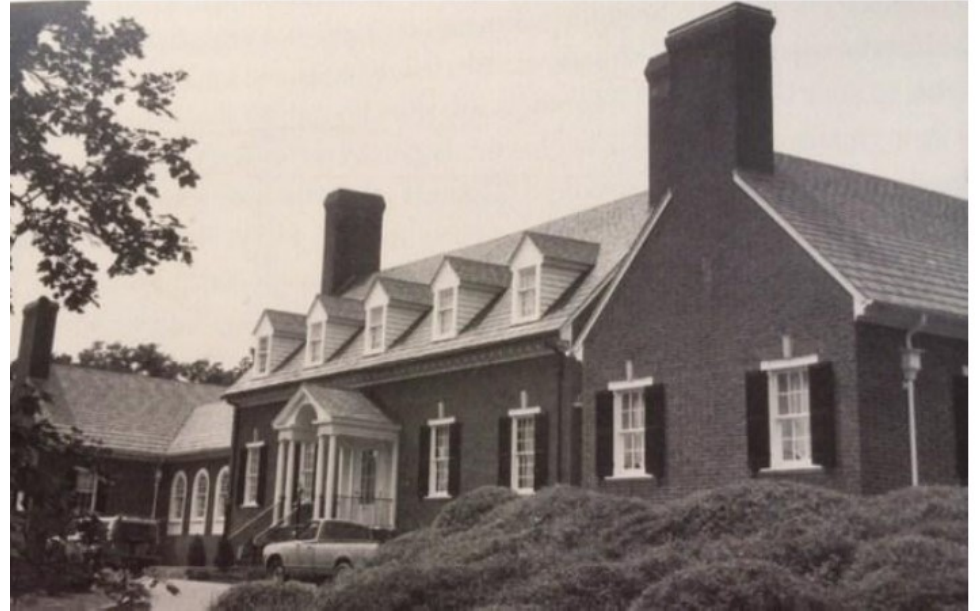
1007 Rugby Road (1928)