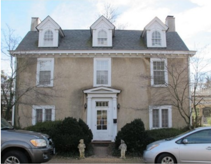
616 Rugby Road (1921)