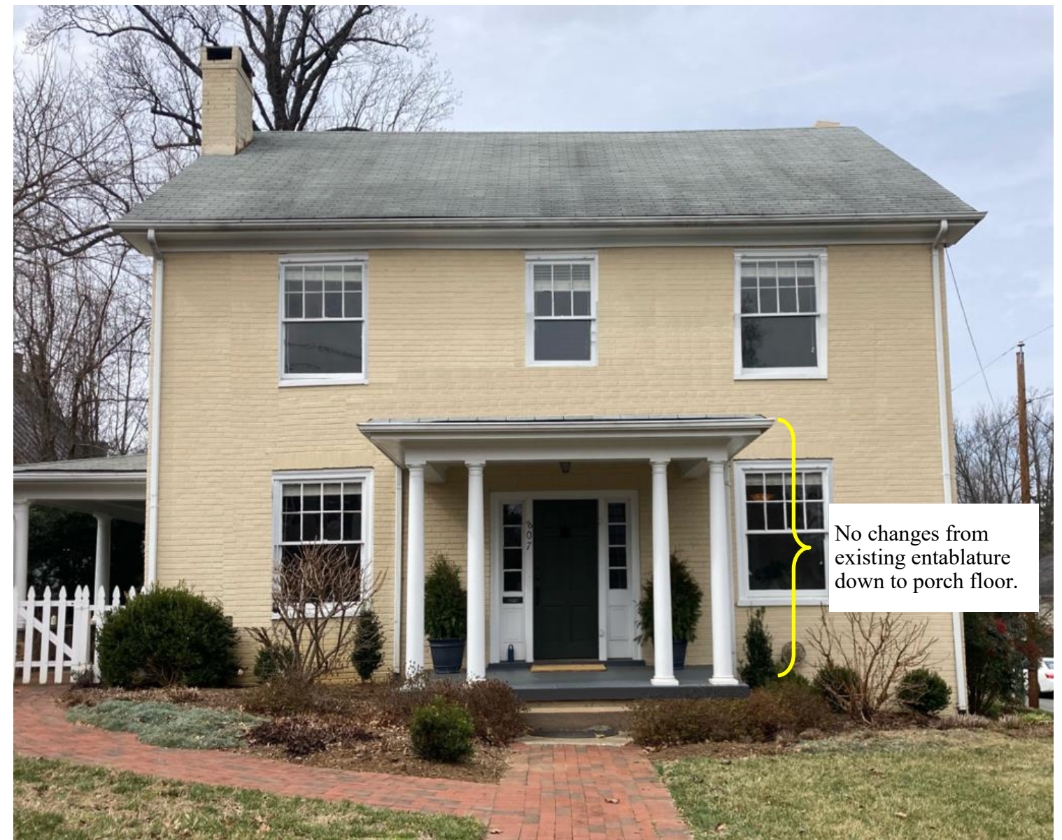
Proposed: either a flat roof (membrane) or a low-pitched roof (metal)