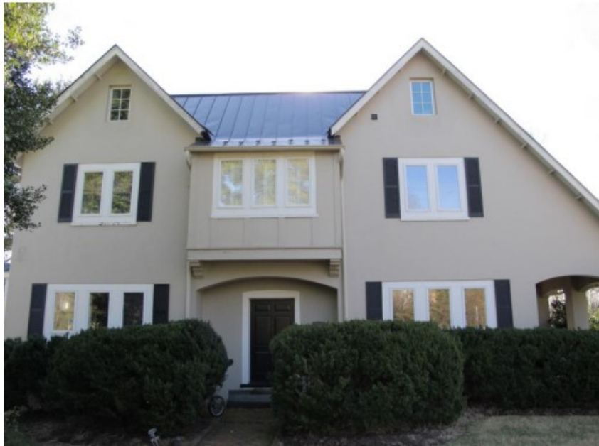
924 Rugby Road (1908)