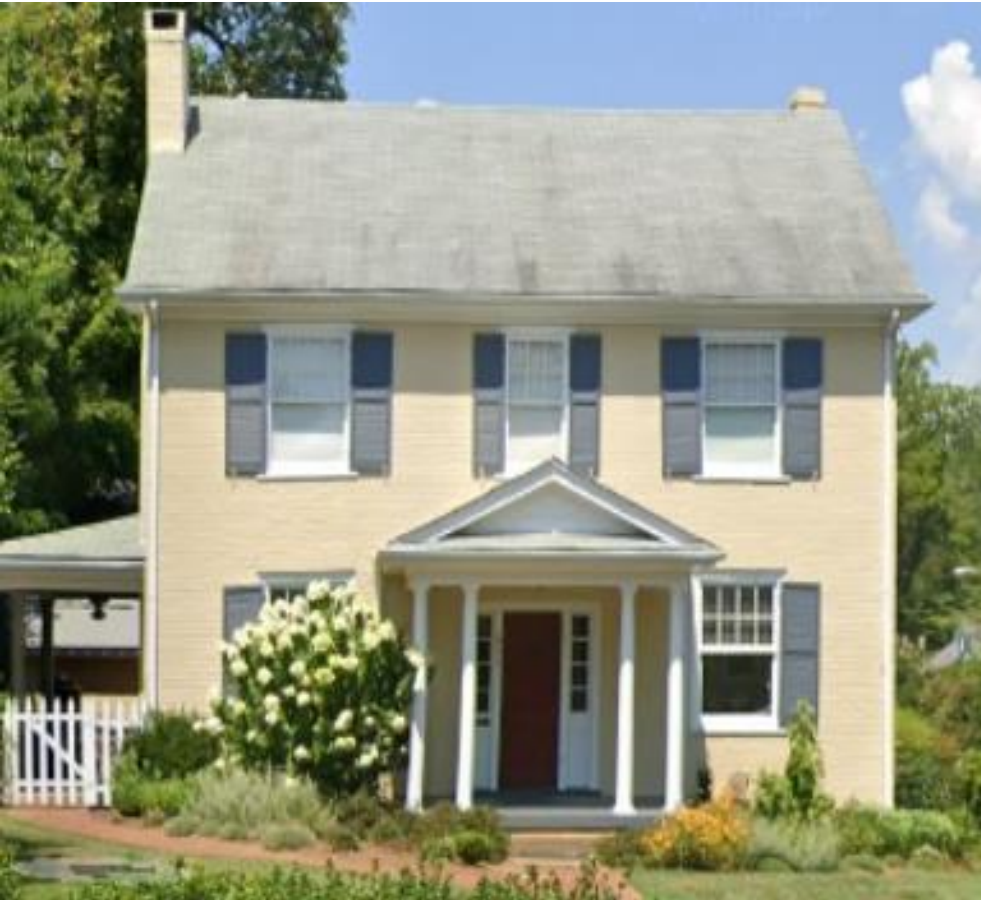
Misc. images of 807 Rugby