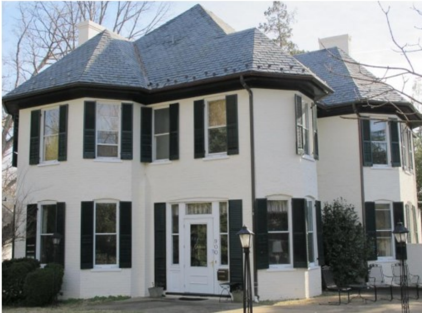
900 Rugby Road (1899)