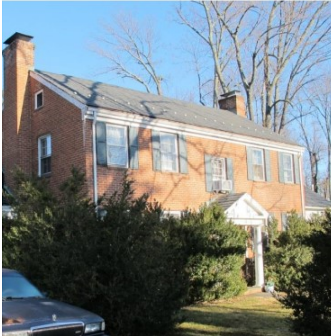
809 Rugby Road (1929)