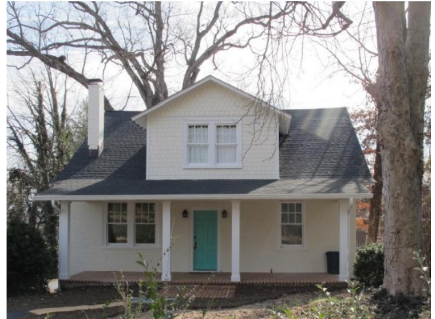
910 Rugby Road (1925)