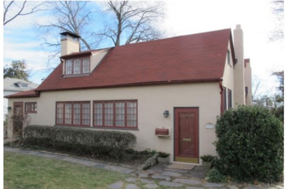
700 Rugby Road (1921)