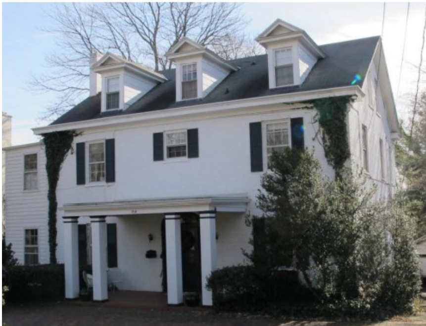
914 Rugby Road (1921)