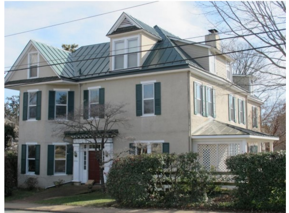
800 Rugby Road (1905)