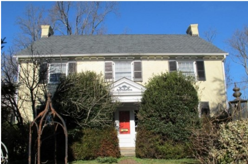
919 Rugby Road (1921)