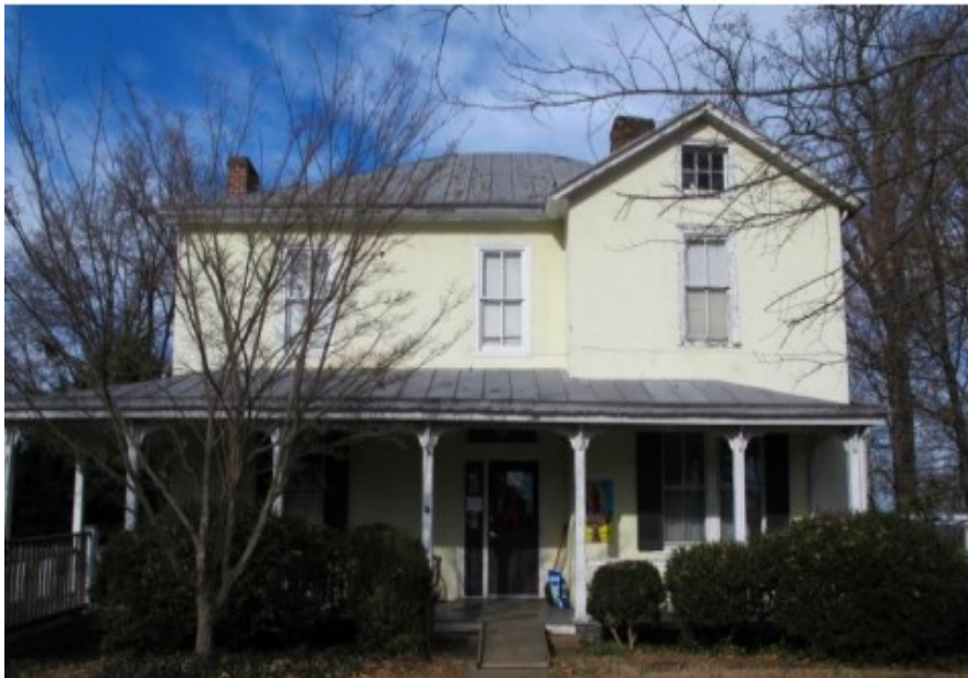
703 Rugby Road (1910)