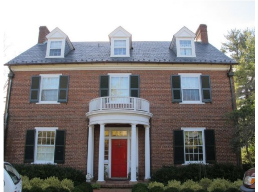
928 Rugby Road (1922)