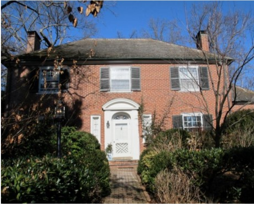
917 Rugby Road (1929)