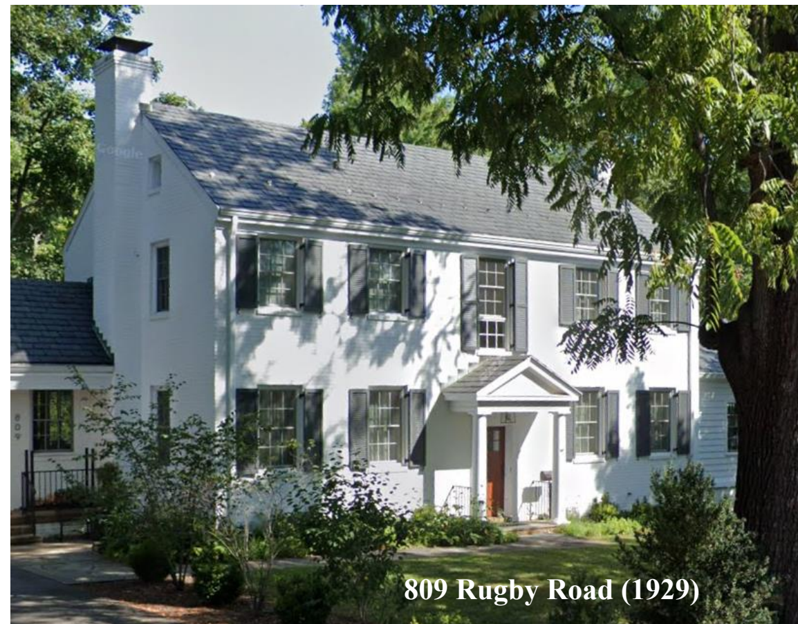
809 Rugby Road (1929)