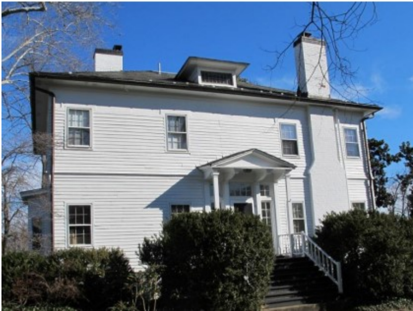
714 Rugby Road (1906)