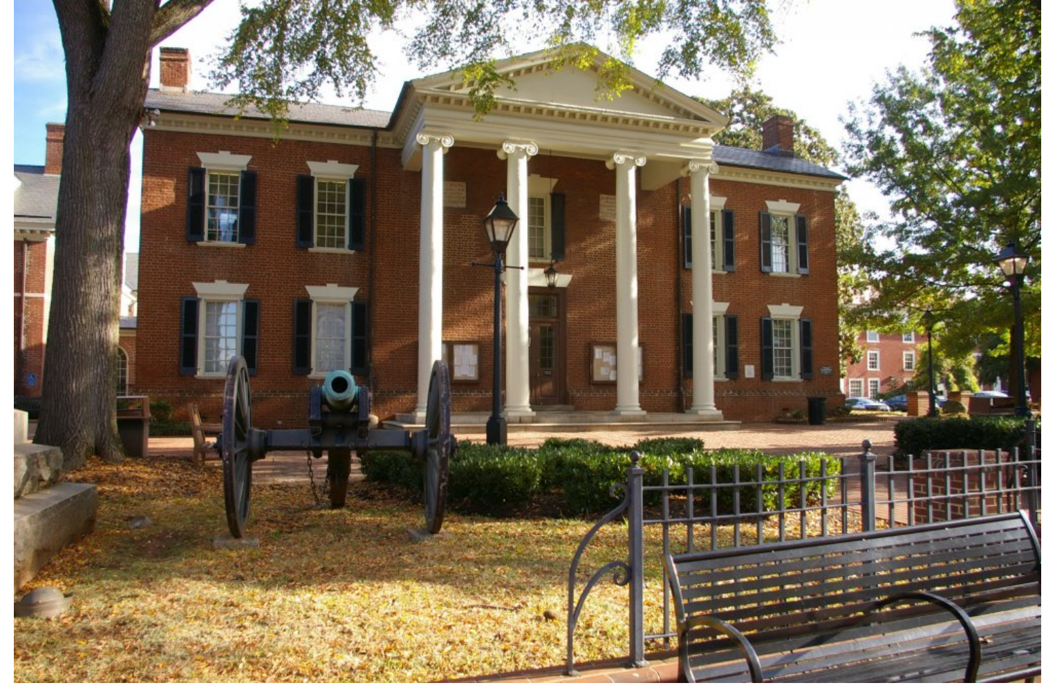
County Courthouse – Charlottesville