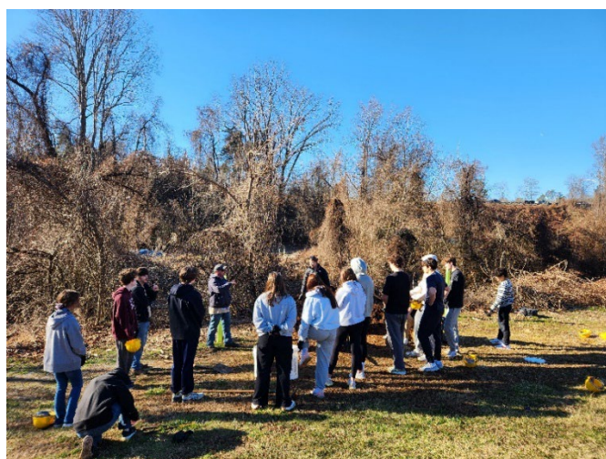
Education and work session with school group (February 2024)