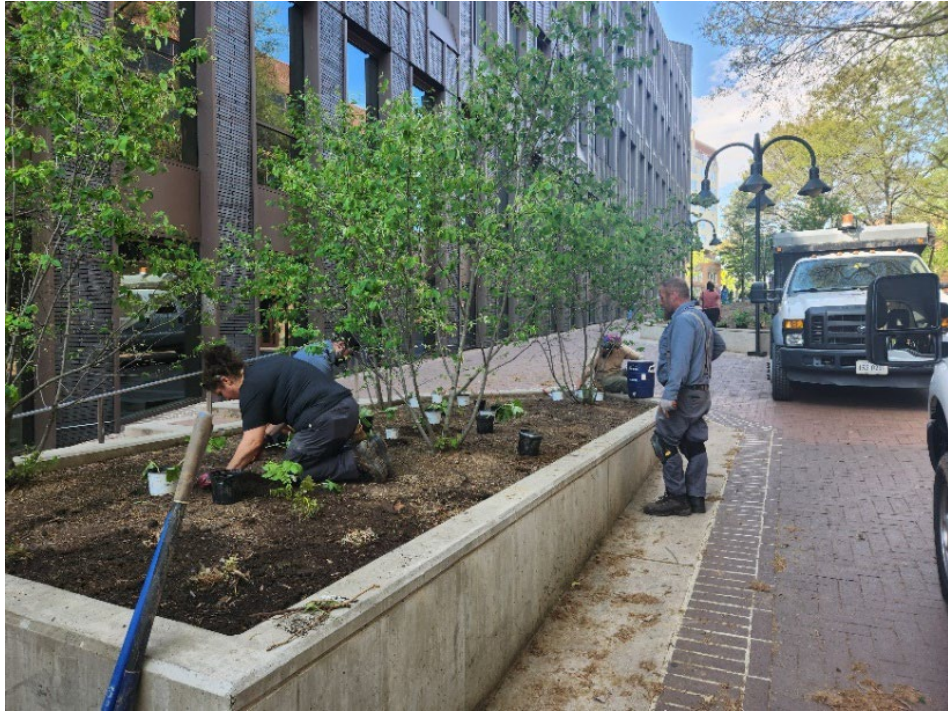
Native plant installation downtown (May 2024)