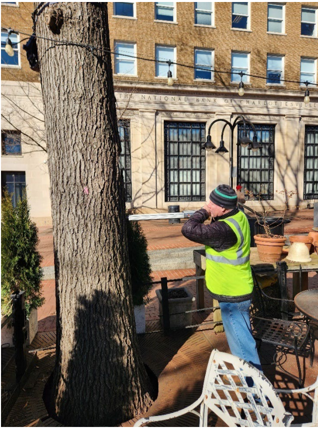
Specialized testing to assess tree health