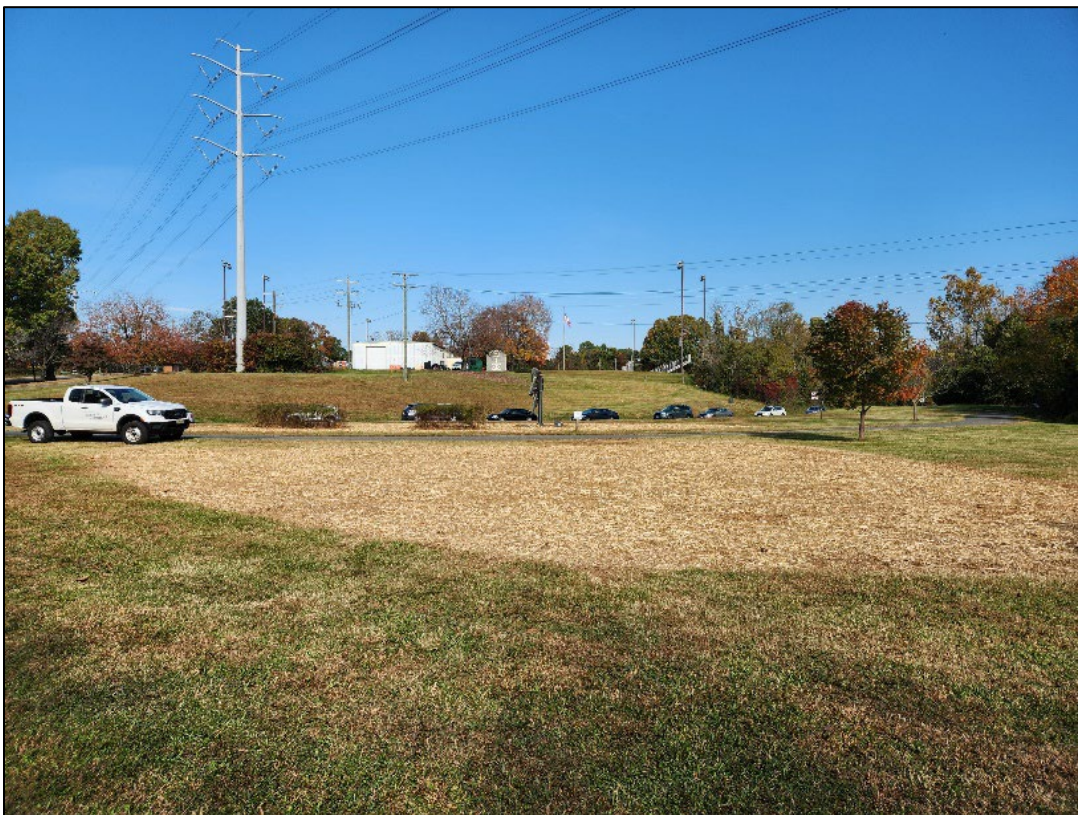
Butterfly Greenway pollinator garden installation (October 2024)