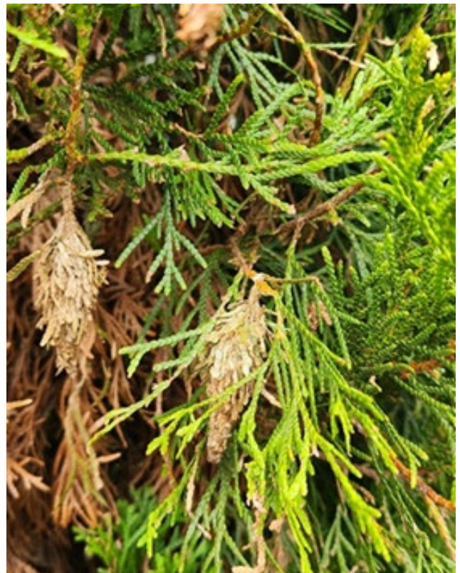
Bagworms at Jenkins Park: removed by hand