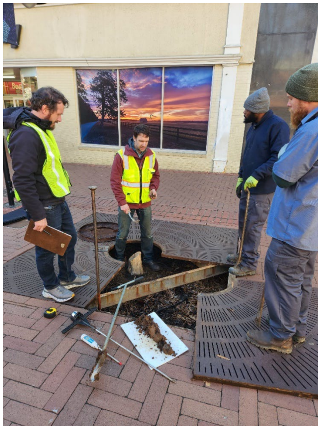
Soil sampling on the Downtown Mall