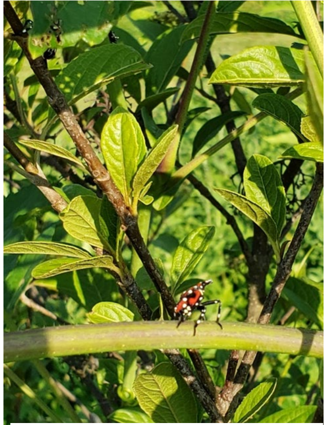
Spotted lanternfly nymph.