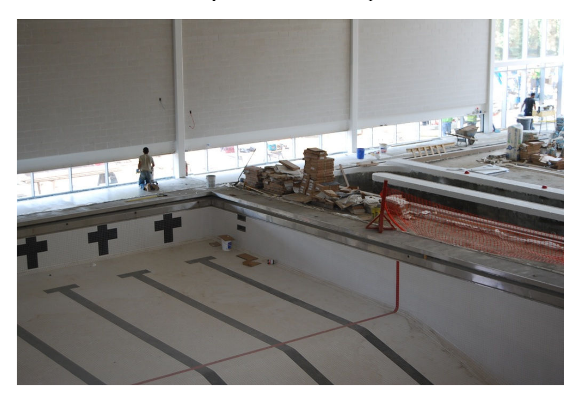
Main Natatorium from Pool Deck