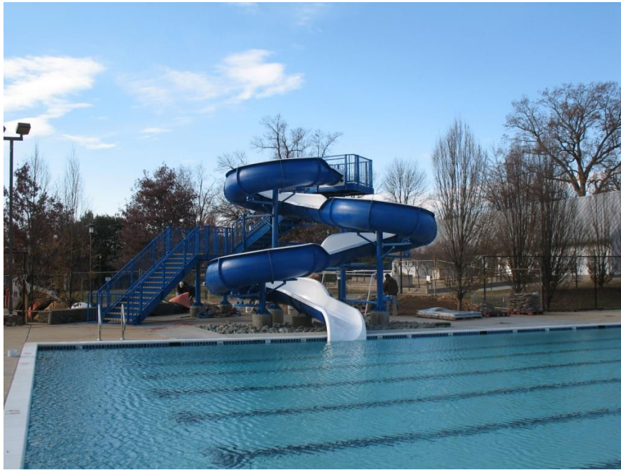
New Coping Stones and Tile