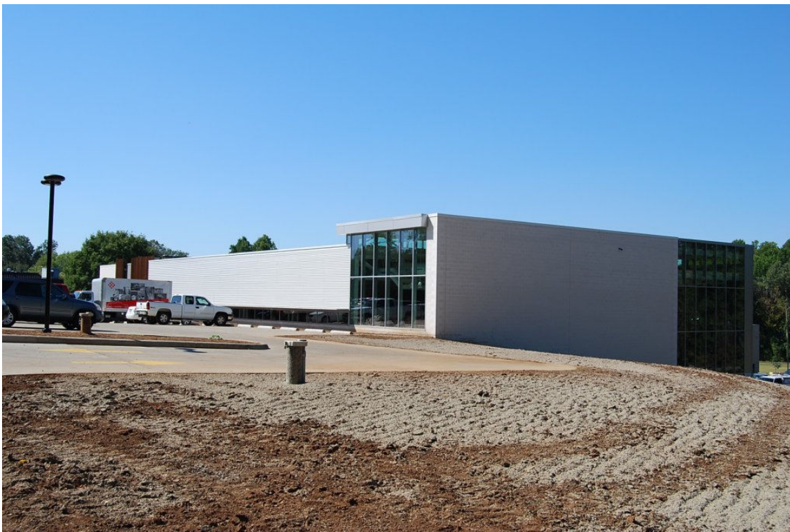
East/North Elevation and Main Entrance

A grand opening date to the general public is tentatively scheduled Wednesday, October 6, 2010. Aquatic programs will begin in the natatorium on Saturday, September 18.