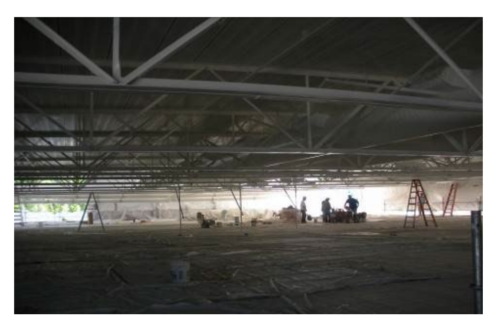
Finish Ceiling & Ductwork

Opening to the public scheduled for September, 2010